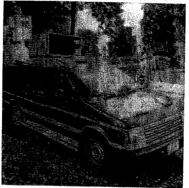
5629 W. Amer Ave 6/12/01