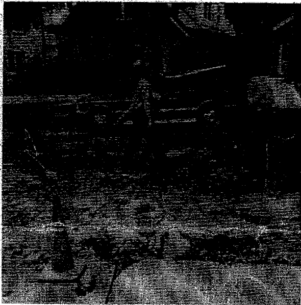
5629 W. Amer Ave 6/12/01