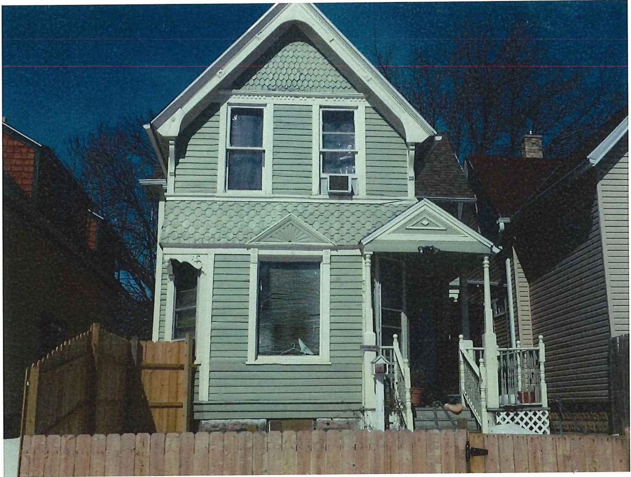
2604 W Juneau