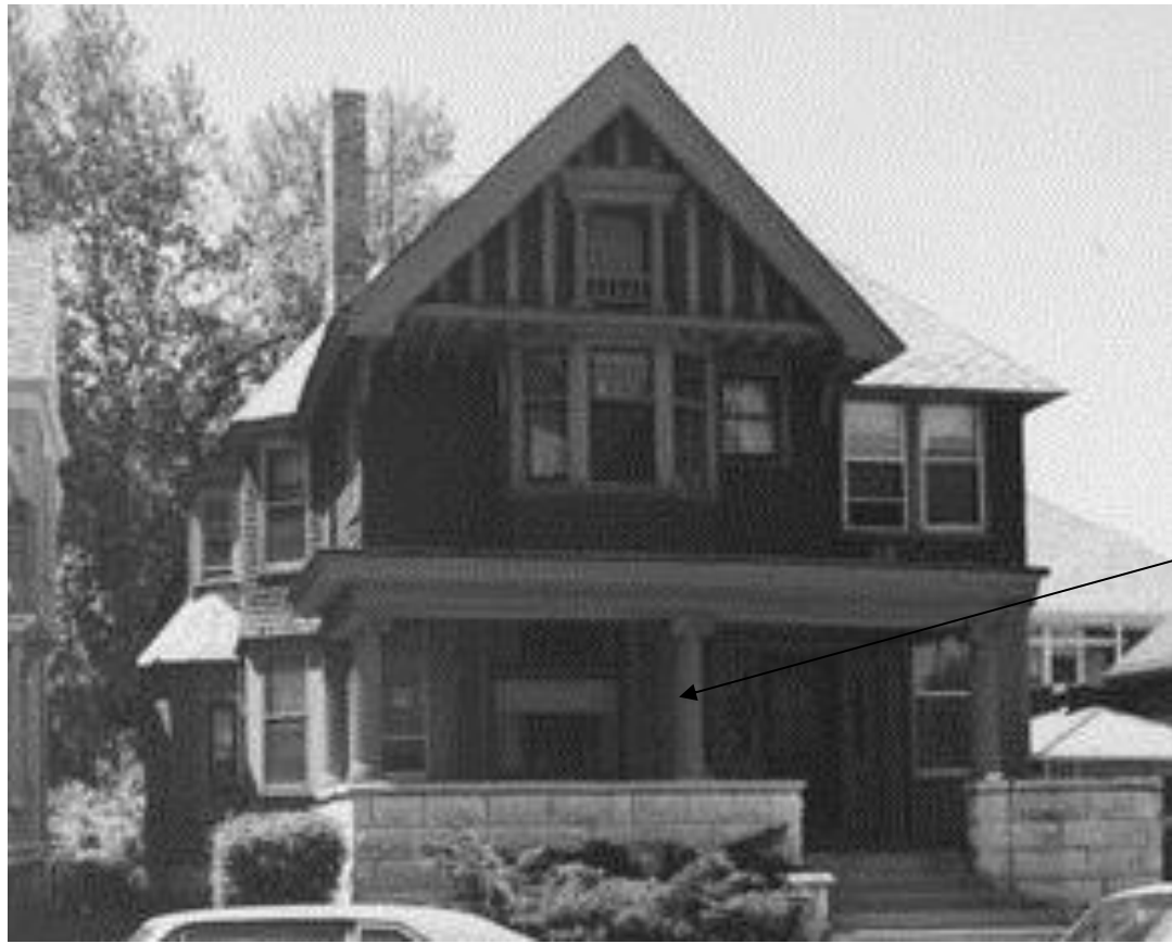
This 1980 survey photo shows the original porch columns.