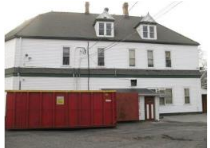
Present condition of rear façade