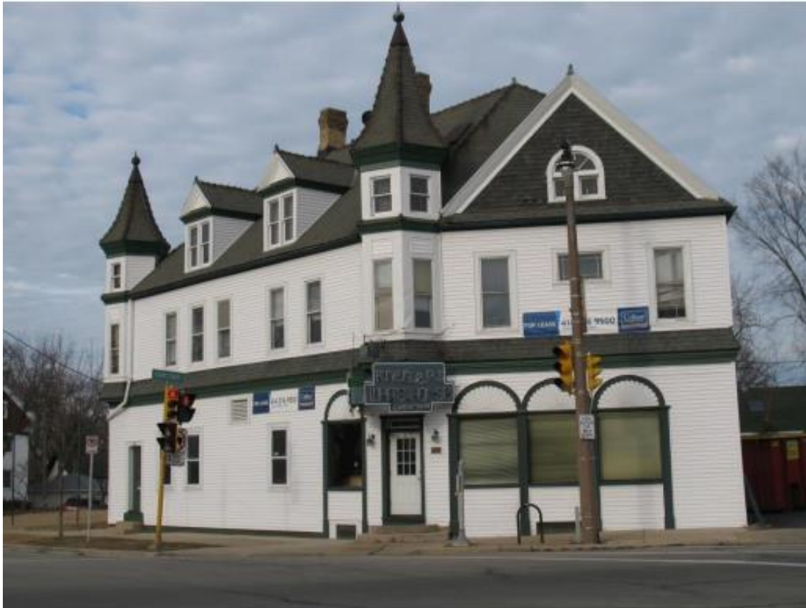
Present condition of front façade