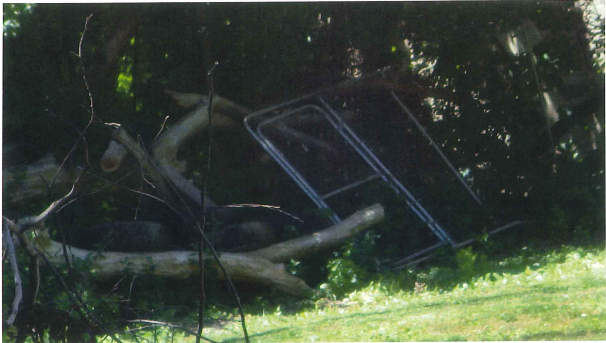
3217 N 5th Street. 7/13/2022. (G. Armstrong/ Special Enforcement) (Violation # 1. Outdoor Storage Facility).