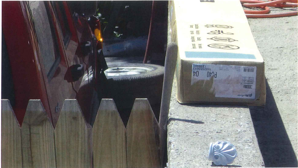
3217 N 5th Street. 7/13/2022. (G. Armstrong/ Special Enforcement) (Violation # 1. Outdoor Storage Facility).