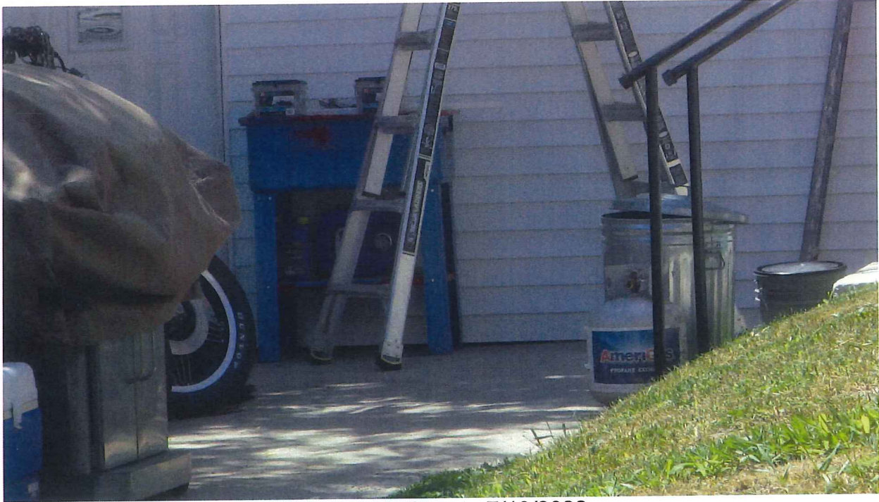
3217 N 5th Street. 7/13/2022. (Violation # 1. Outdoor Storage Facility).