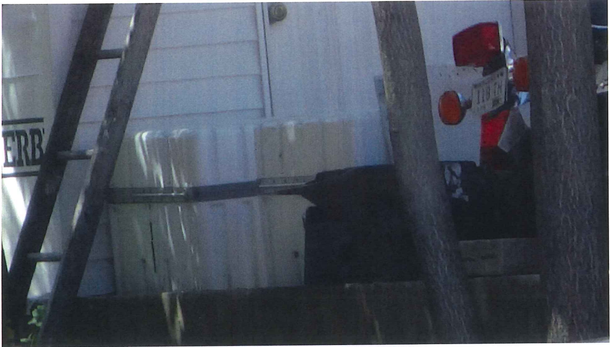
3217 N 5th Street. 7/13/2022. (G. Armstrong/ Special Enforcement) (Violation # 1. Outdoor Storage Facility).