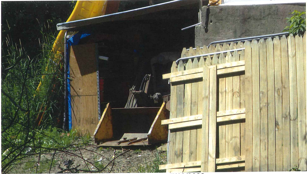
3217 N 5th Street. 7/13/2022. (Violation # 1. Outdoor Storage Facility). (Violation # 3. Contractor's Yard).