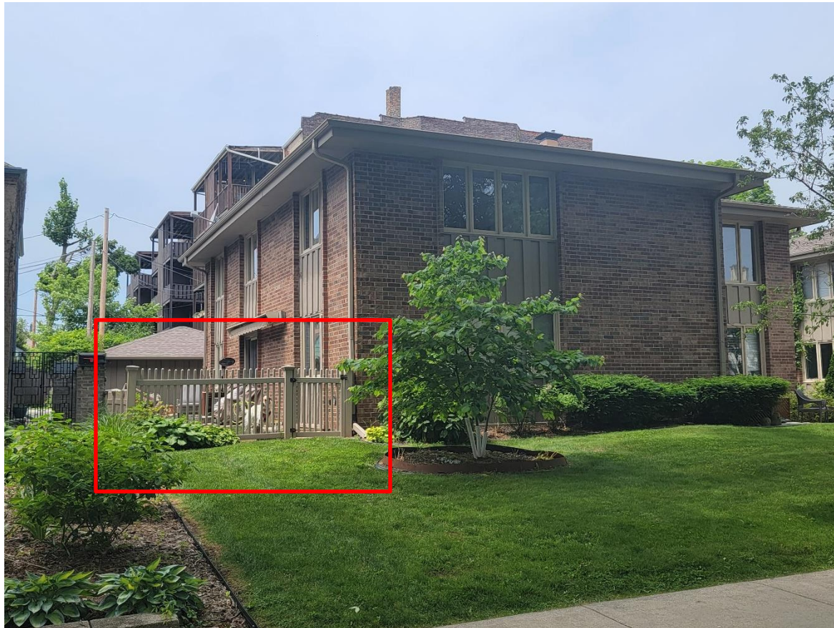
Existing vinyl fence

Copies to: Development Center, Ald. Brostoff