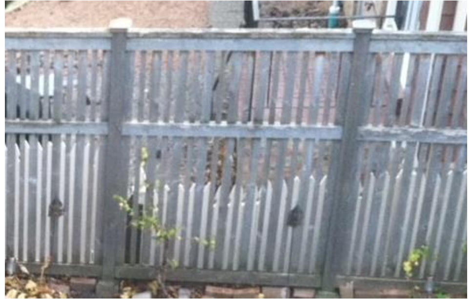
Fence location and fence design