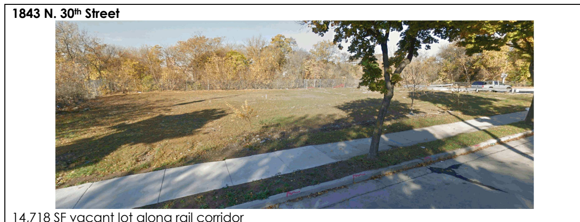
14,718 SF vacant lot along rail corridor