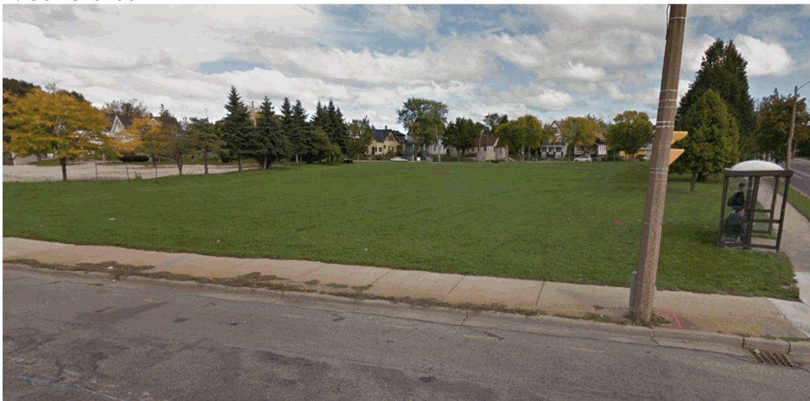
68,728 SF vacant lot along W. Center Street.