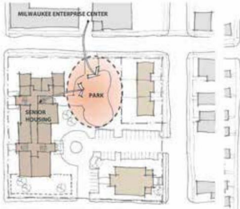
Fifth Street School | MLK Charrette