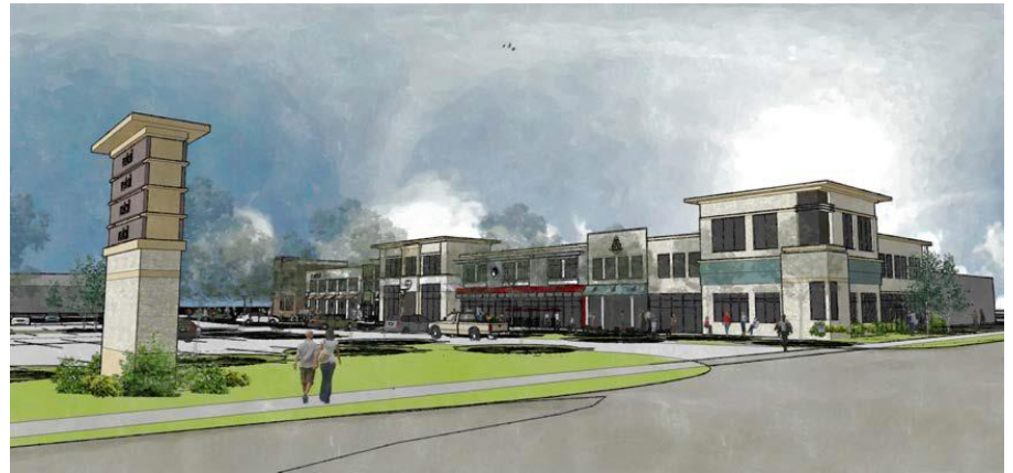
27 th and Layton | South 27 th St. Charette