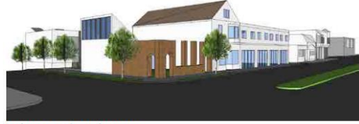
looking northeast from National Avenue