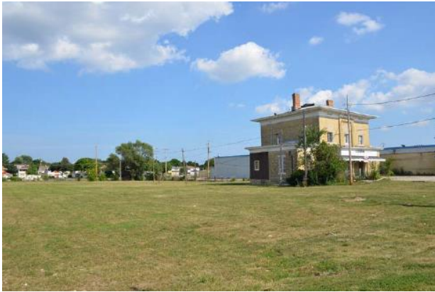
Wildenberg Hotel | South 27 th St. Charette