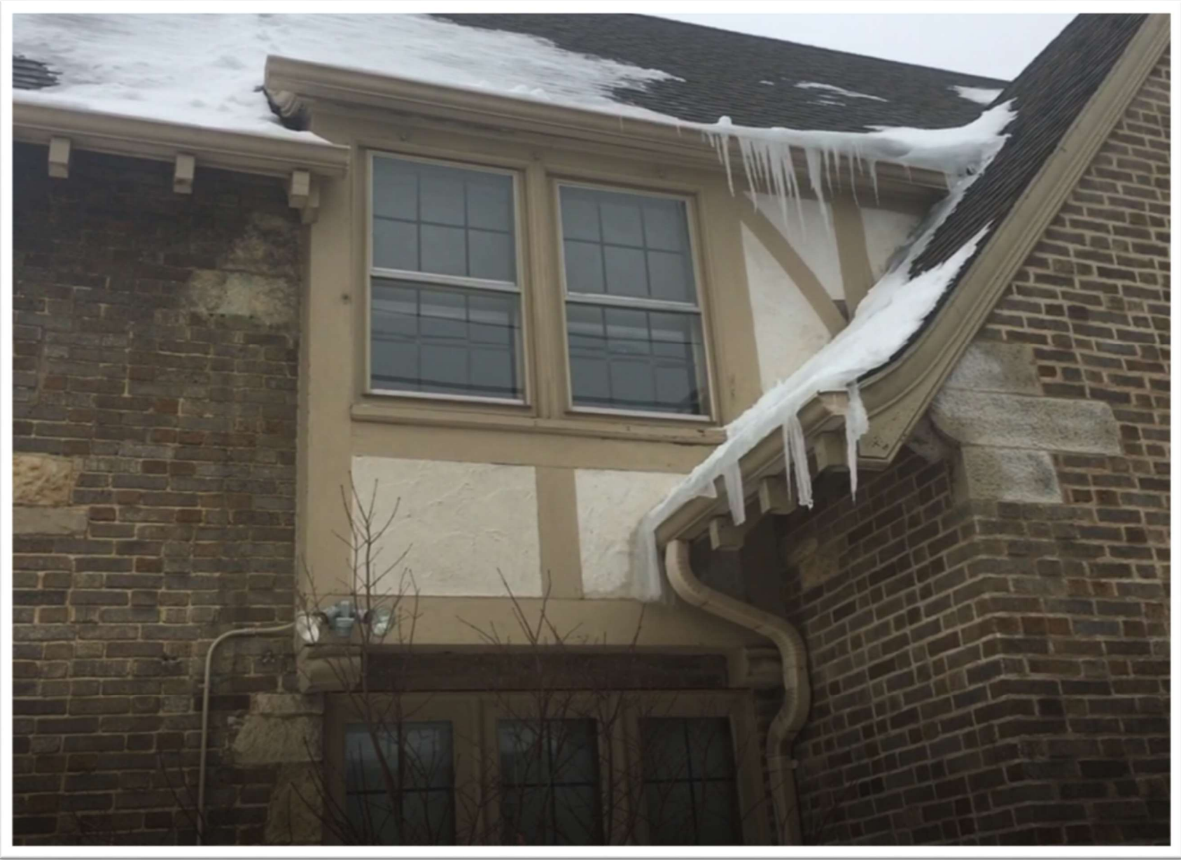
Figure 6. Some of storm/screen combinations to be replaced on east elevation.