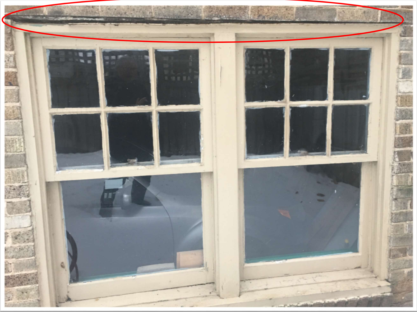
Figure 1. First floor (garage) lintel to be replaced on north façade.