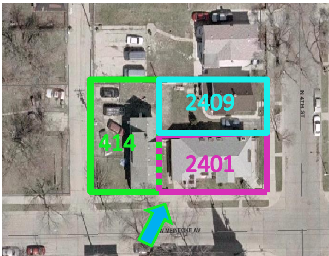
Original lot lines