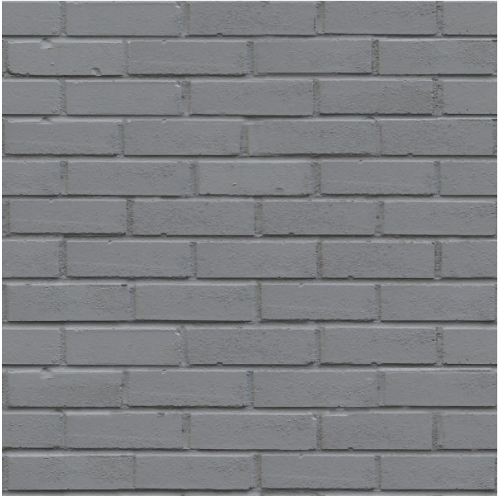
Painted Brick (color representative)