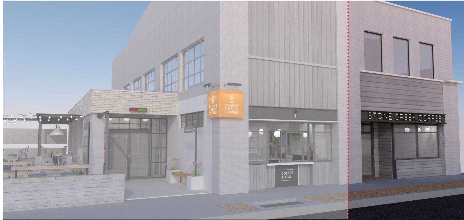
Rendering Looking Southeast

Previously Approved Project | Addition to Project