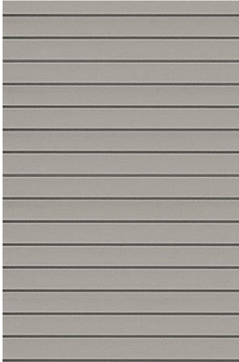
Wood Siding to Match Existing (image representative)