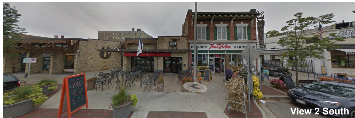
View 2 South