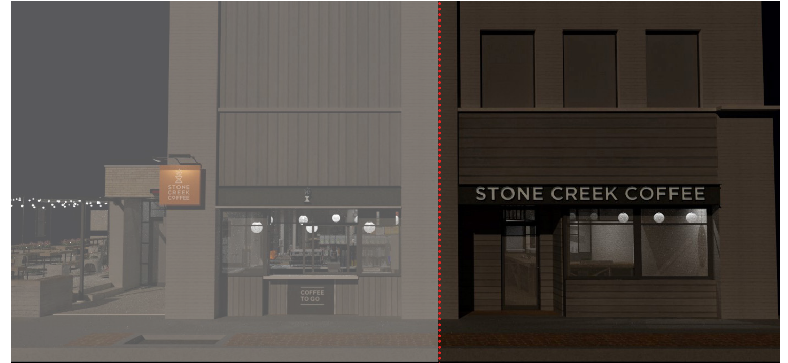
Rendering Downer Ave Elevation - NTS

Previously Approved Project | Addition to Project