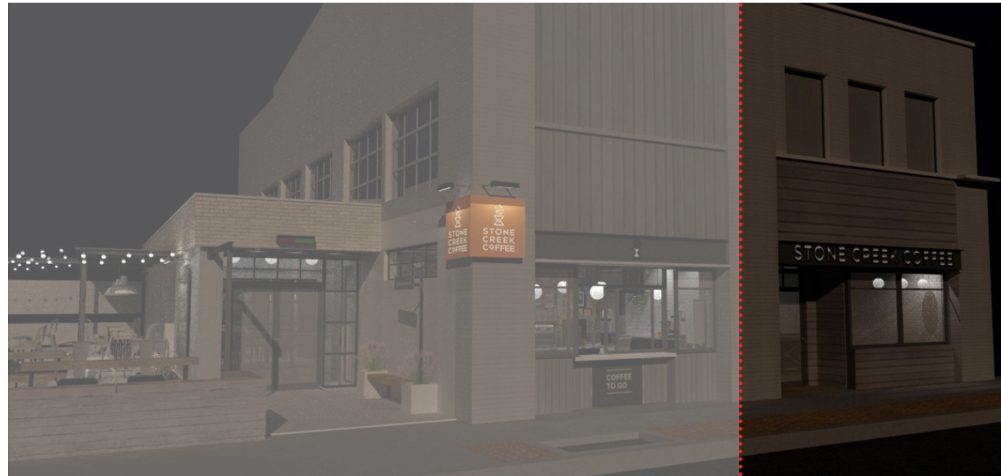
Night Rendering Looking Southeast

Previously Approved Project | Addition to Project