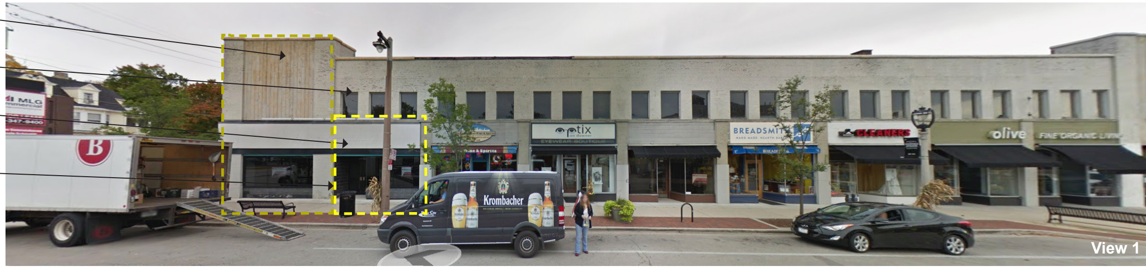
Existing Streetscape (Eastside of Downer Ave)

Replace existing storefront entry and windows