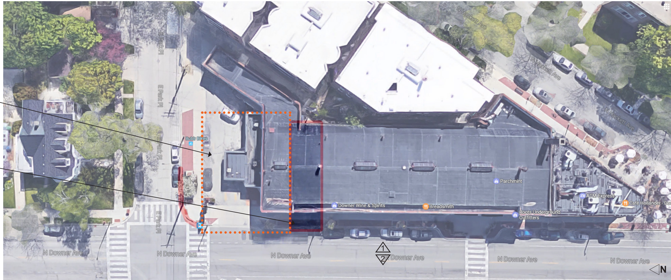
Existing Site Aerial