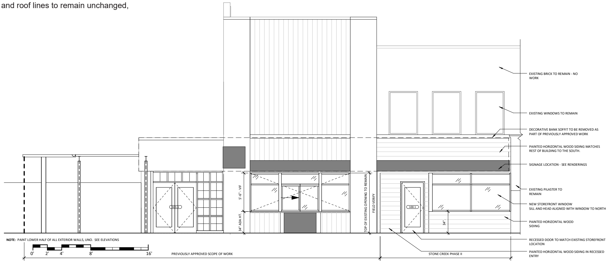
Downer Ave Elevation 1/8" = 1'-0"

NOTE: All building heights and roof lines to remain unchanged,