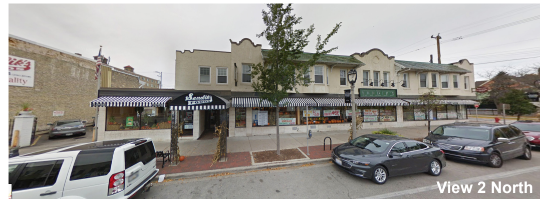
View 2 North