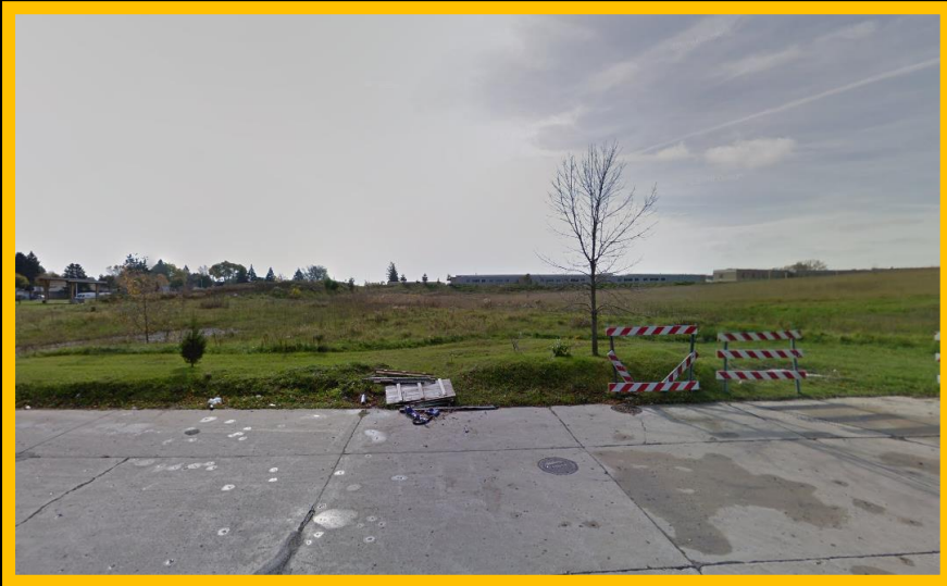
View from N. 61 st and W. Green Tree looking south