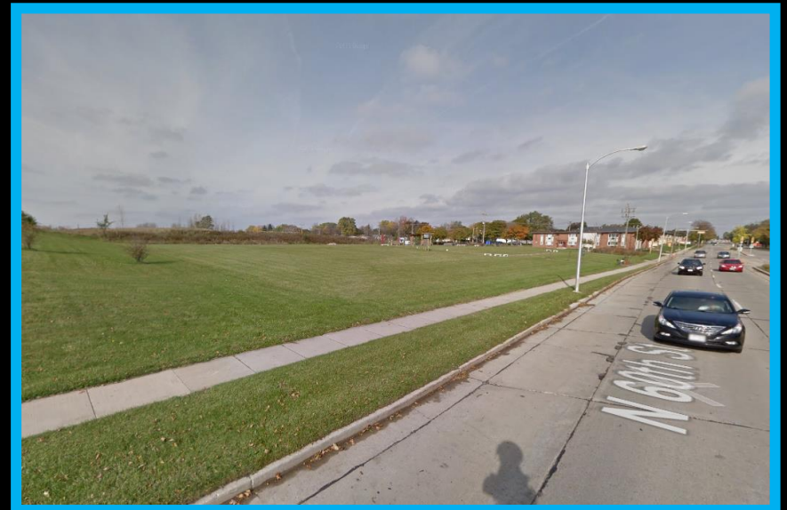
View from North 60 th Street looking north-west