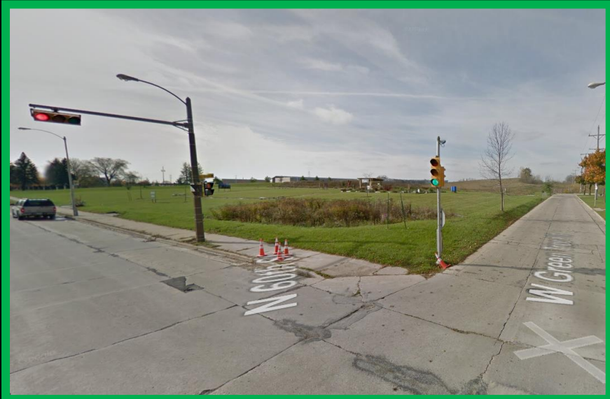
View from N. 60 th & W. Green Tree looking south-west