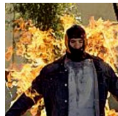
Hammer Museum's "Made in L.A." Biennial 2014: Our Preview