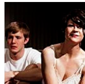
How an L.A. Theater Can Have a Hit But Still Lose Money