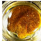
Another Honey Oil Lab Blows Up - This One, in Malibu