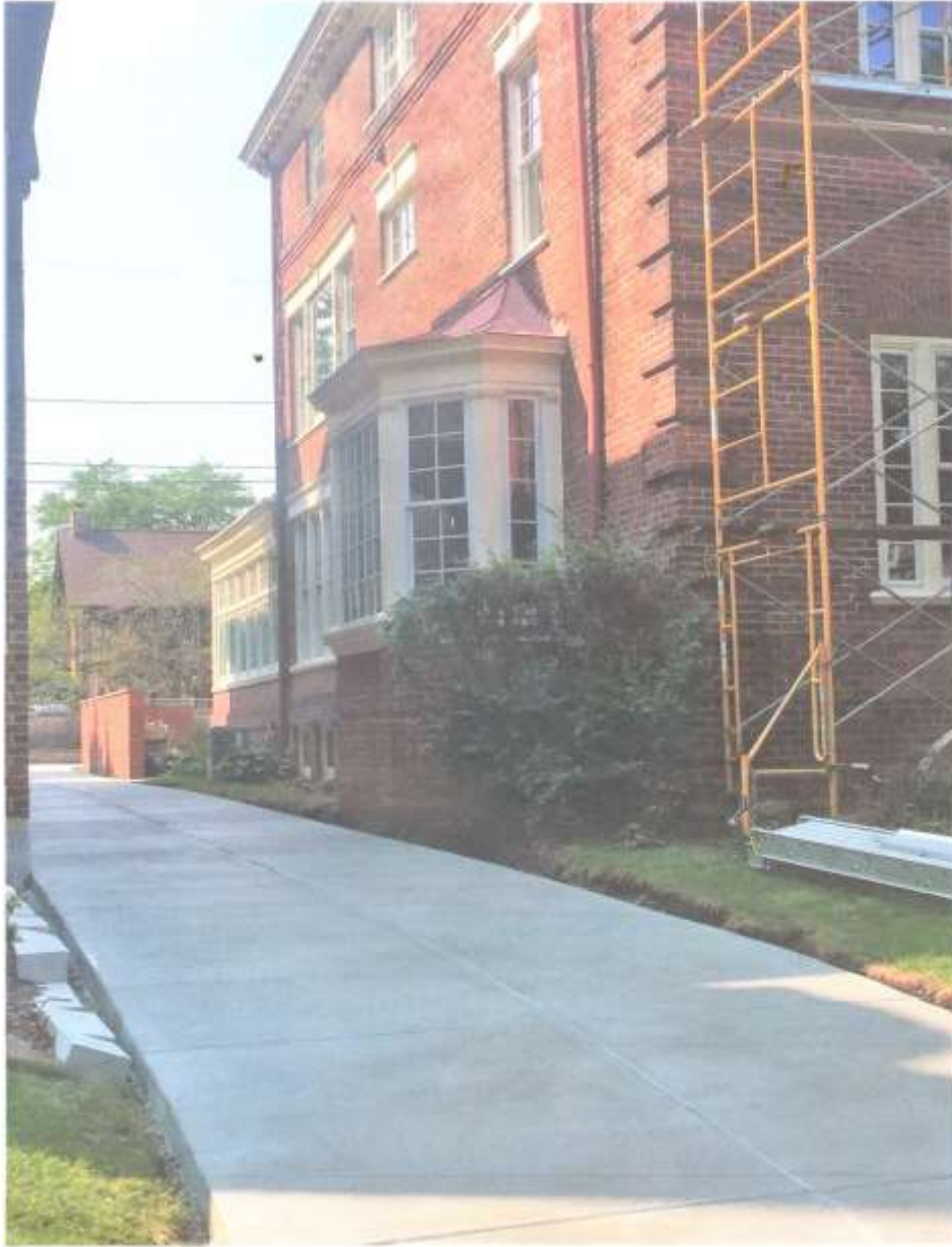
Completed driveway work.