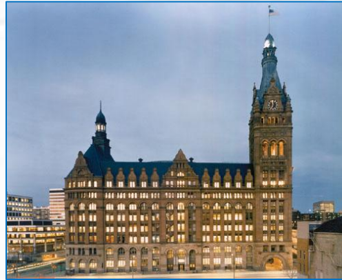
Historic City Hall