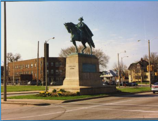
Frederick William von Steuben