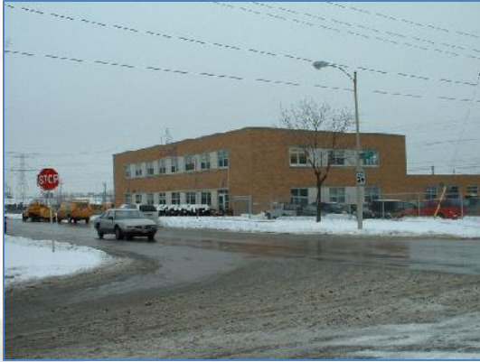
North District Field Station