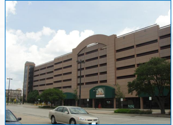
4 th and Highland