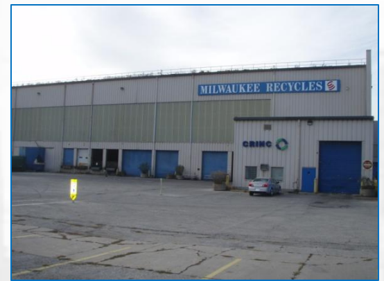
Material Recovery Facility