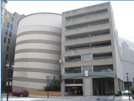
2 nd and Plankinton