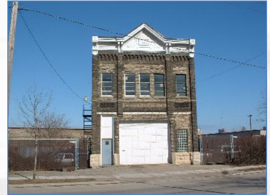
United Indian Community Center