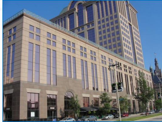
1000 North Water