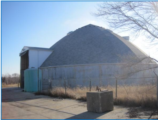
NW Garage Salt Dome