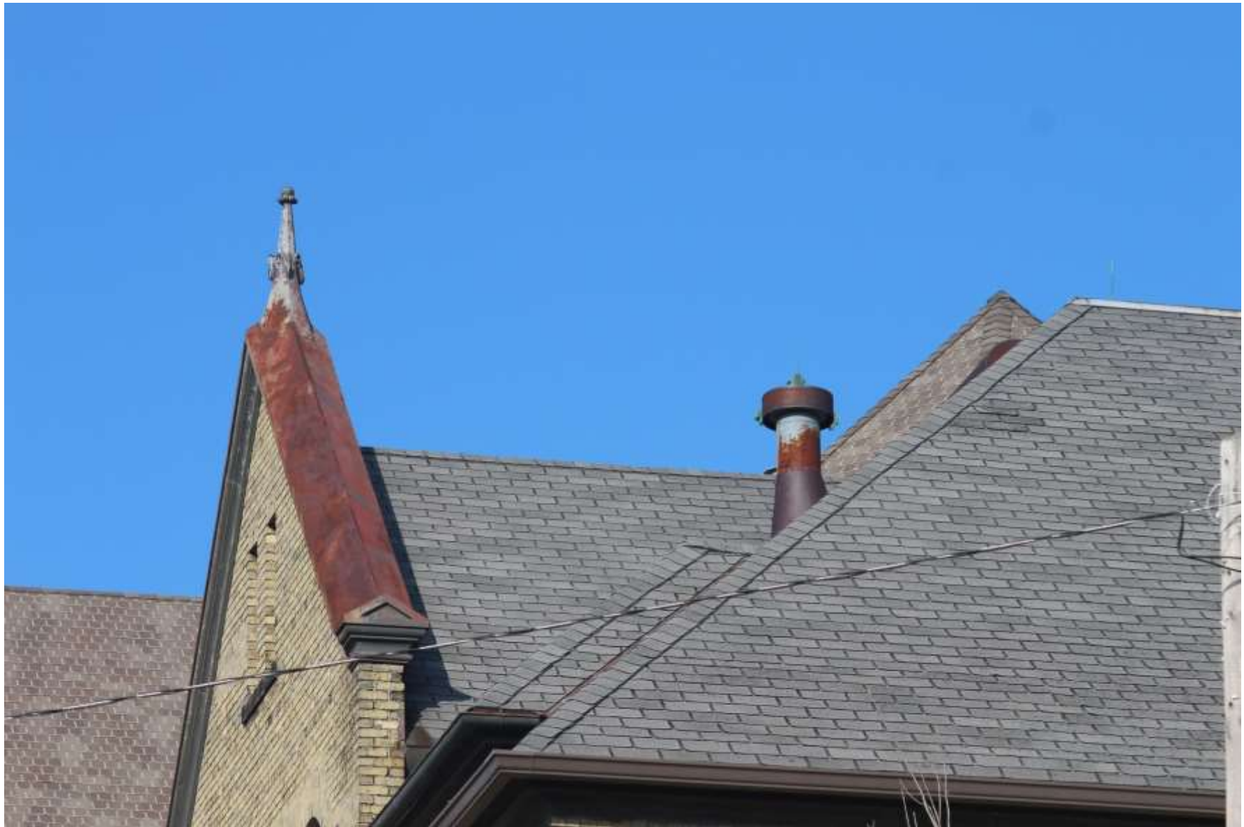
Typical roof detail. Note rusted coping, flashing, and ventilator.