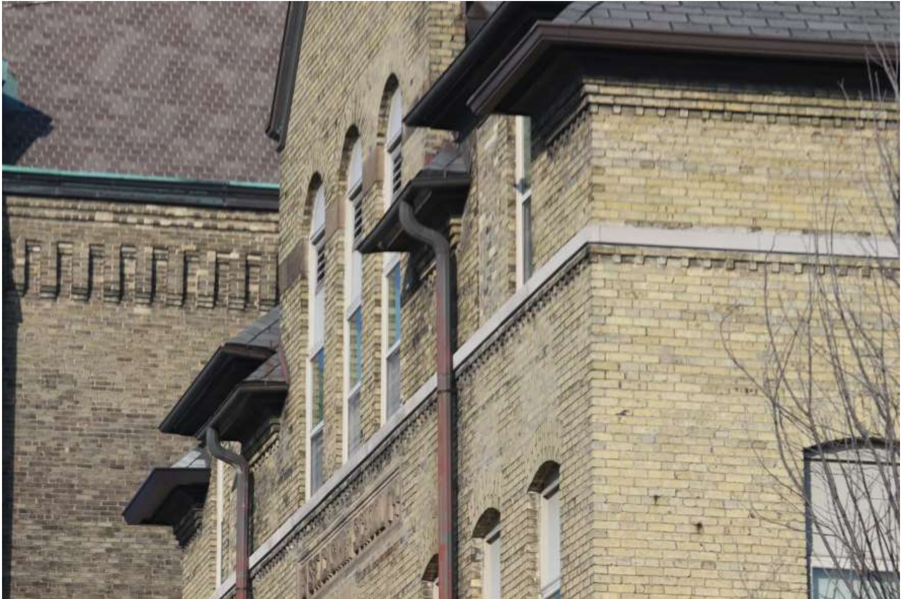
Clarke Street elevation