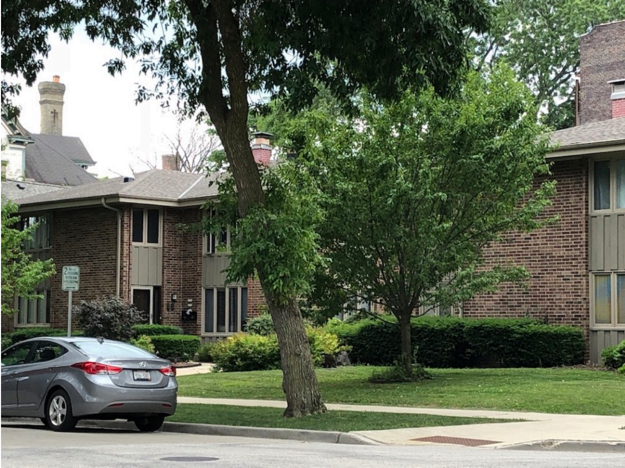
View of Subject Property from across the street, and to the north