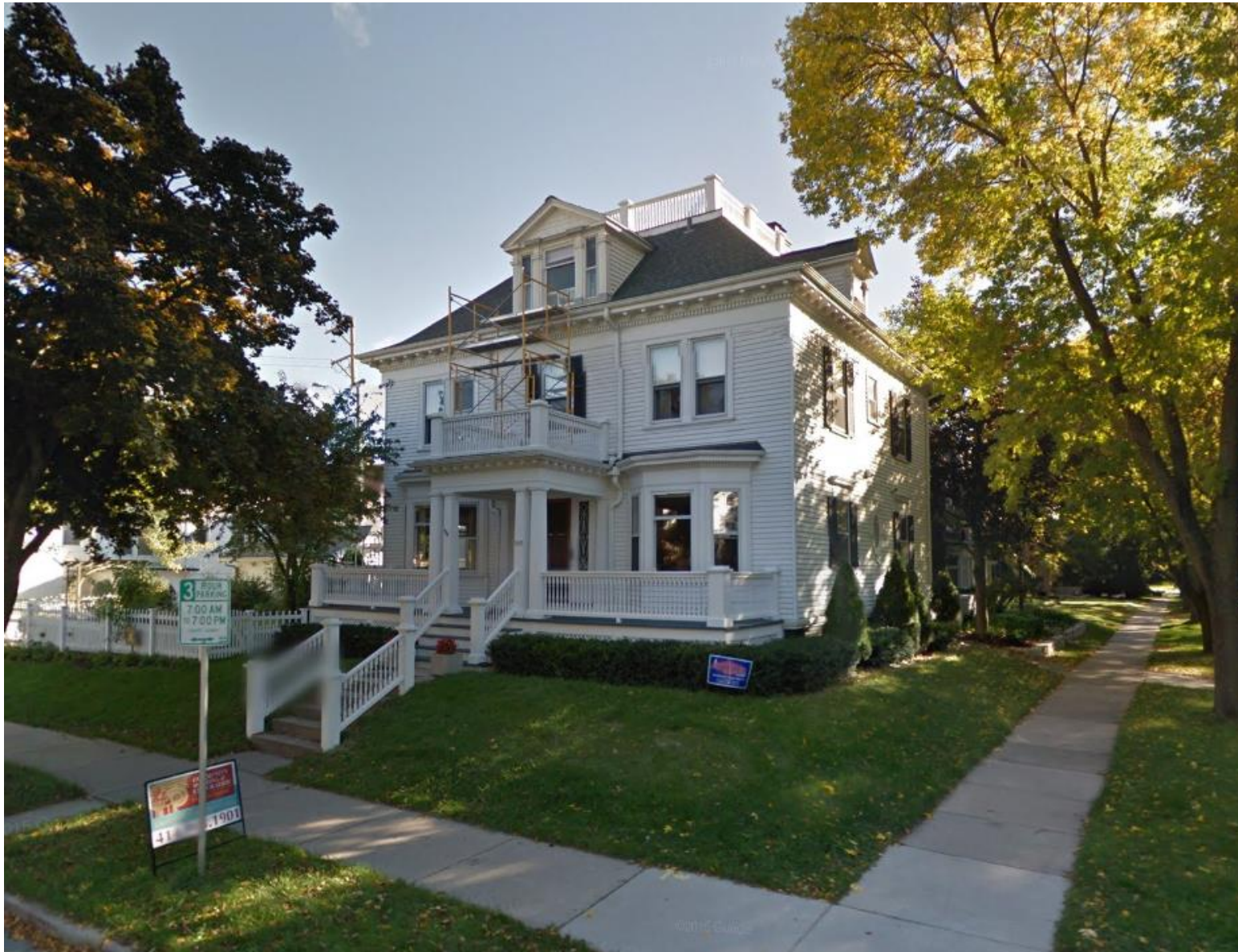
Street view of the home ca. Sept. 2015