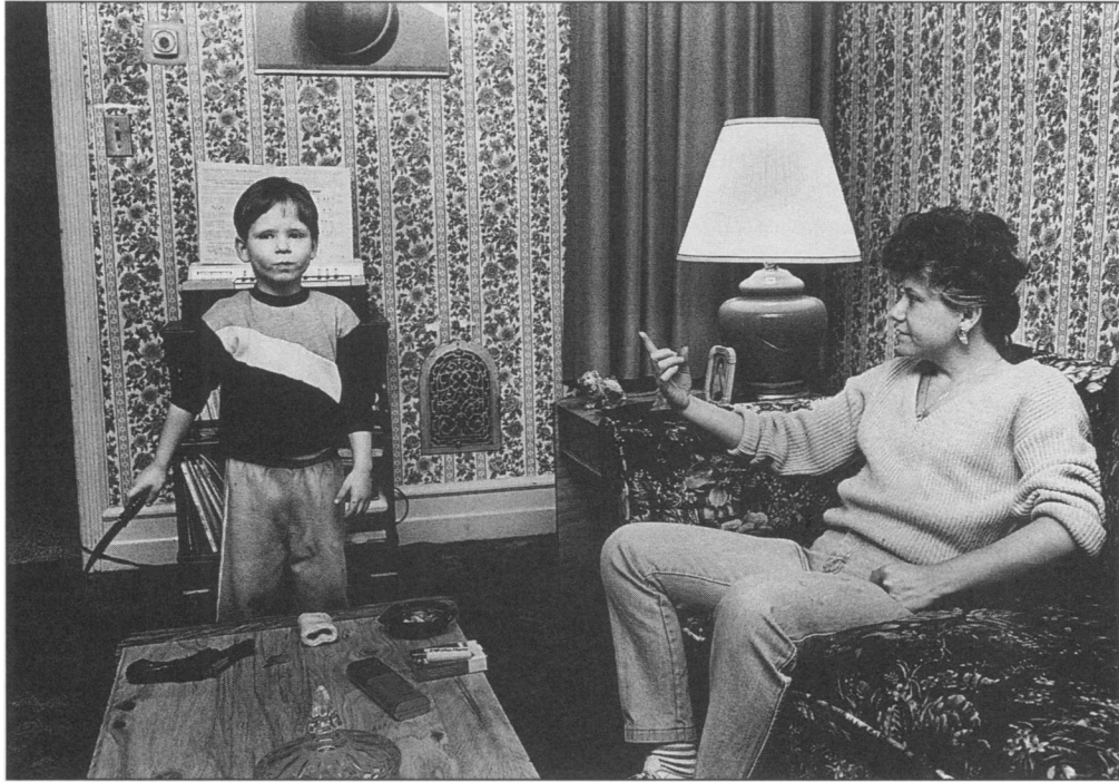
© Donna Ferrato/DOMESTIC ABUSE AWARENESS, INC. (NYC) from the book LIVING WITH THE ENEMY (Aperture)