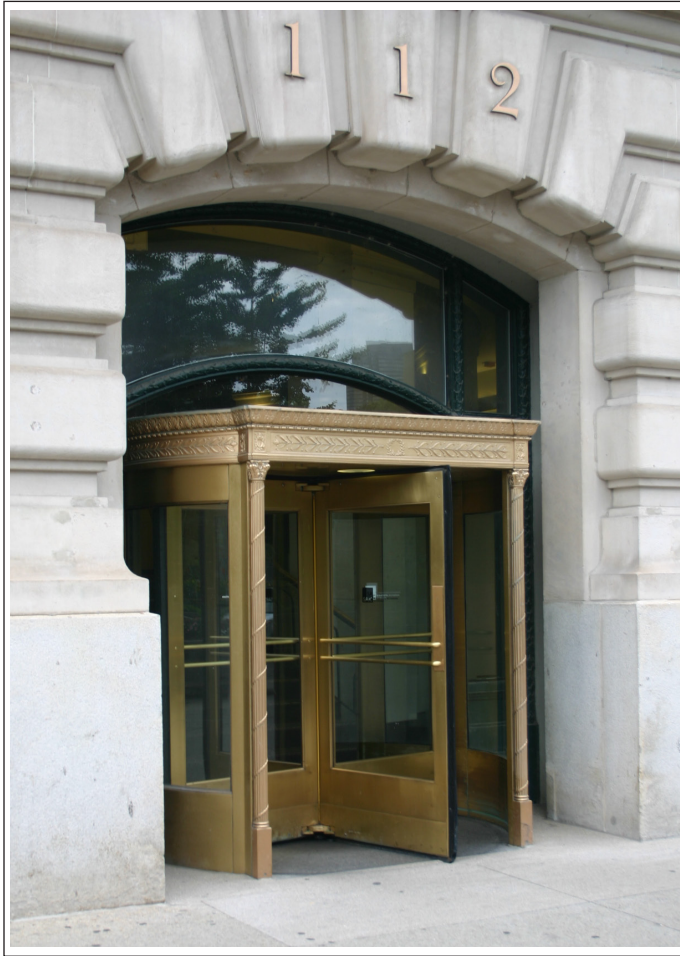
Historic building vestibule, distinct form but within property line

Design Guideline: Vestibules exterior to the building's façade are discouraged on buildings classified as Pivotal by the Historic District designation, (see page 6). Proposals for this type of Alteration will be closely reviewed by the Architectural Review Board. A Special Privilege Permit from the City may also be required,