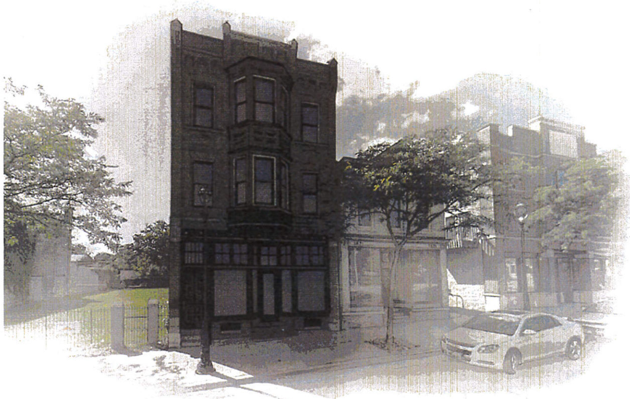
1817 N MARTIN LUTHER KING DRIVE