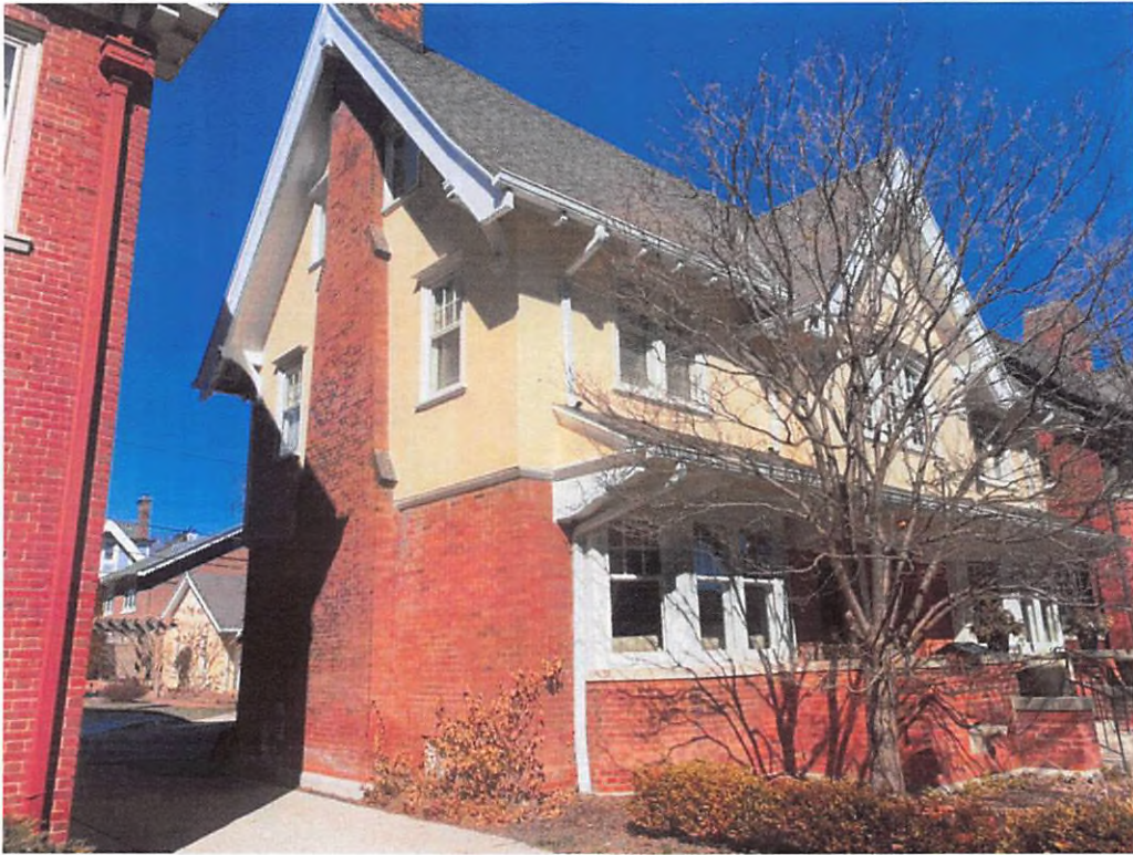
South side of house