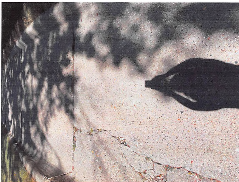
Driveway – cracked with deteriorating curbs.