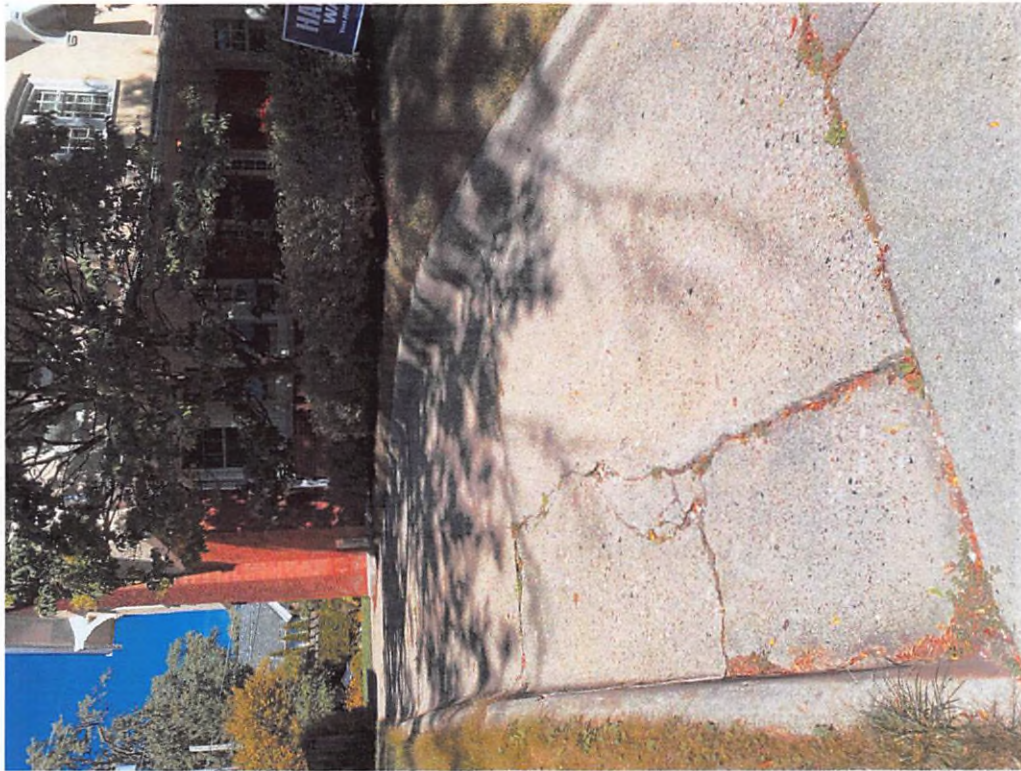
Driveway – cracked with deteriorating curbs.