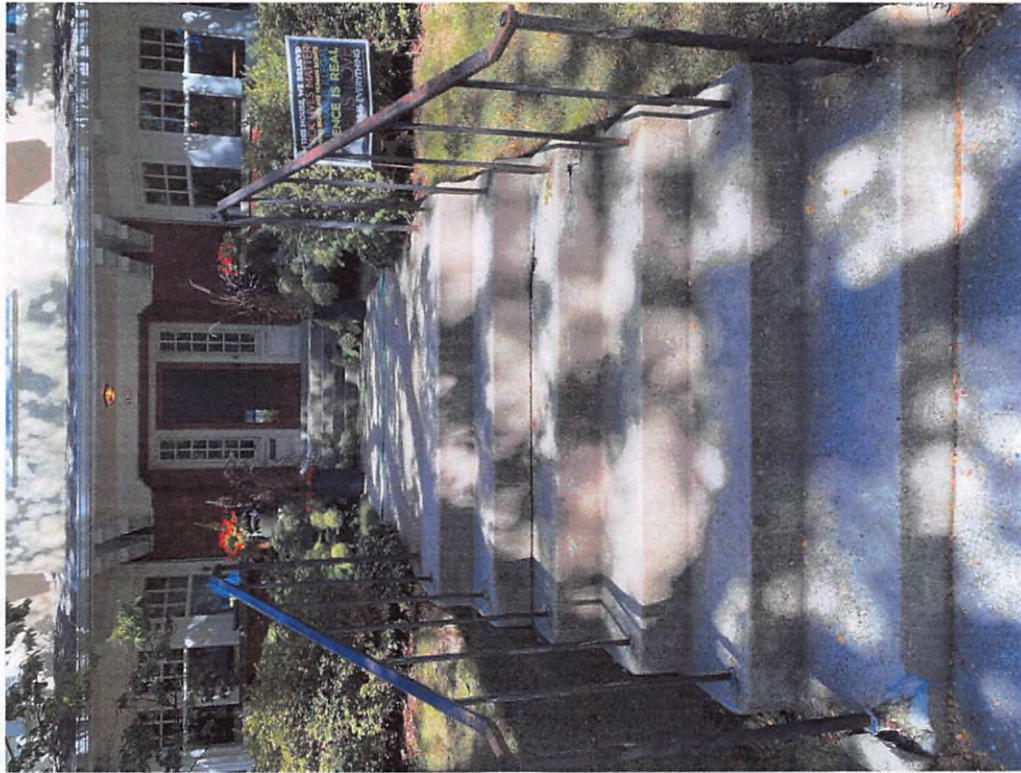
Front steps – cracked with railing that has become unstable.