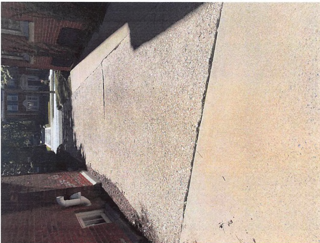
Looking from back yard – new concrete (poured in 2007) vs old concrete. The front half of the drive was not replaced in 2007.