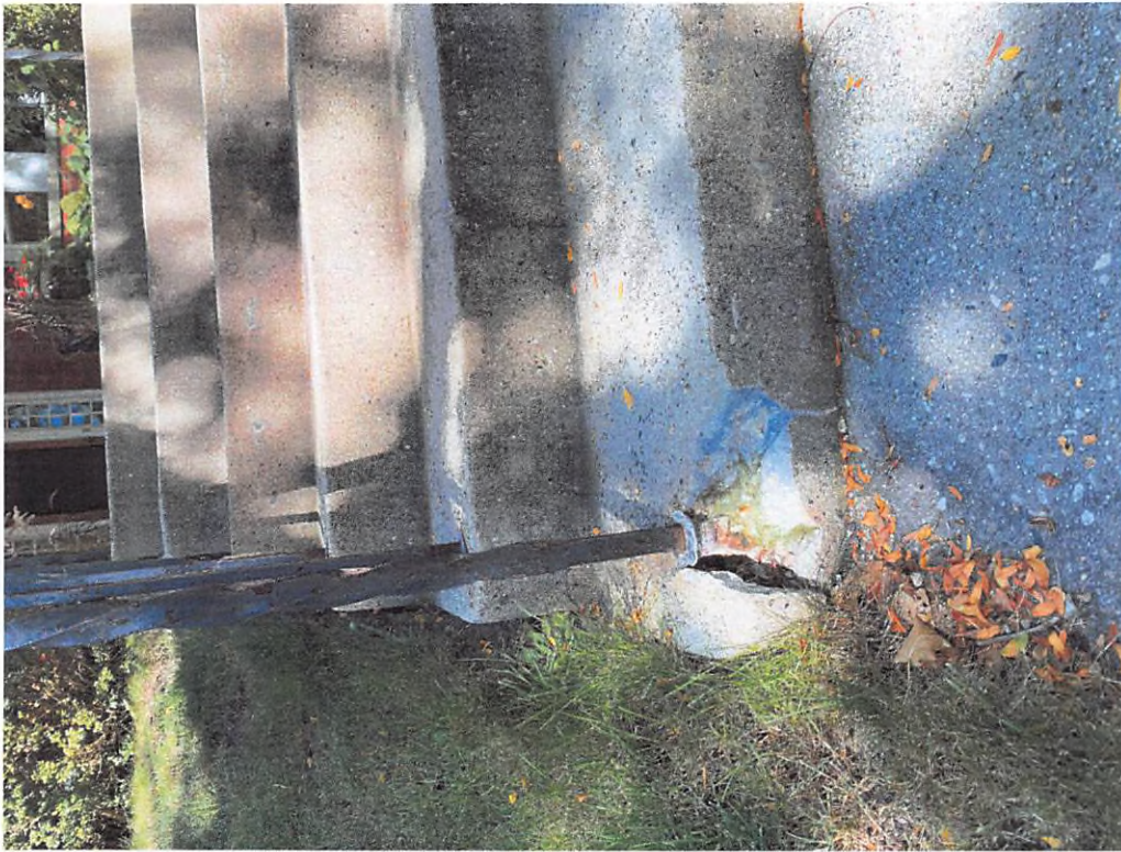
Front steps and deteriorating concrete and railing