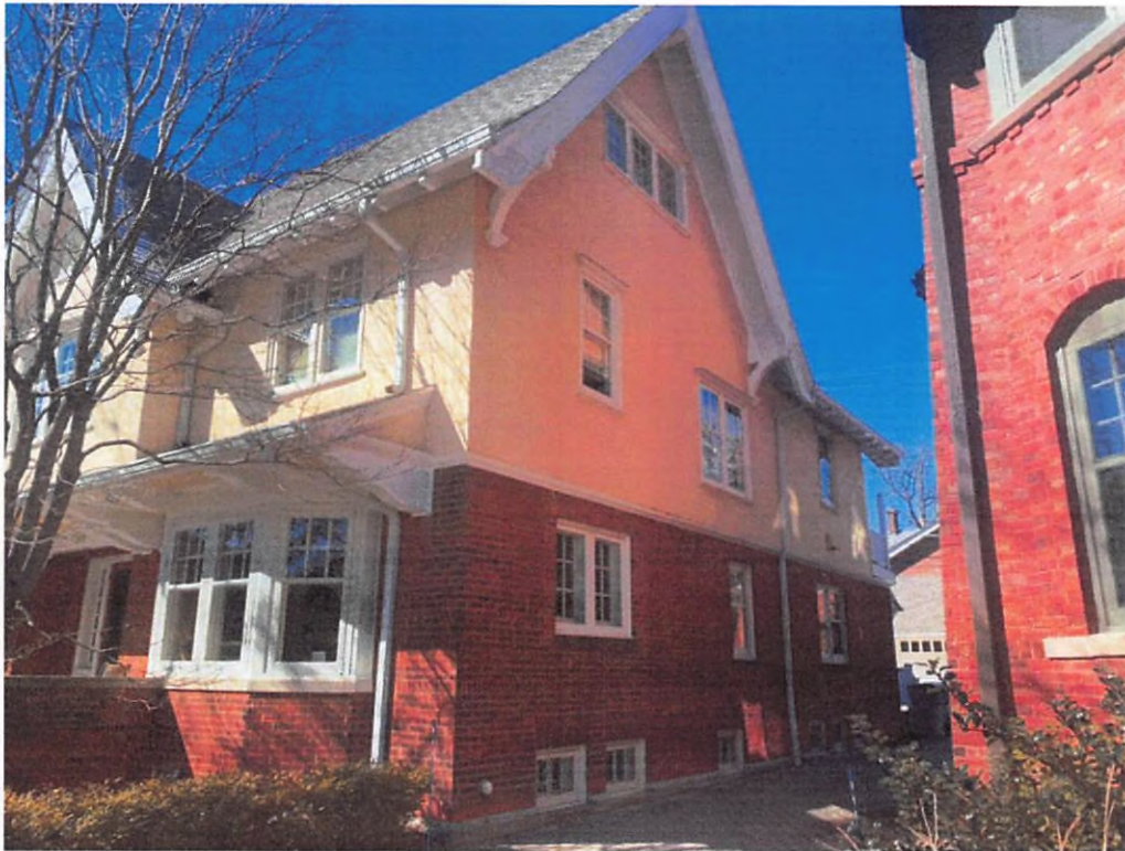
North side of house