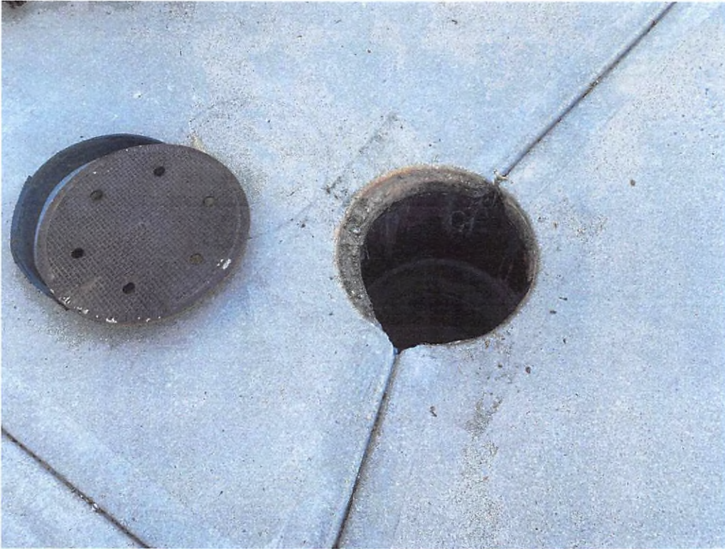
Sewer drain in backyard with manhole cover. The collar no longer holds the manhole cover in place which means we have a significant hazard in our backyard. Sewer drain is approximately 5 feet deep and 20” wide – enough for someone to fall into.