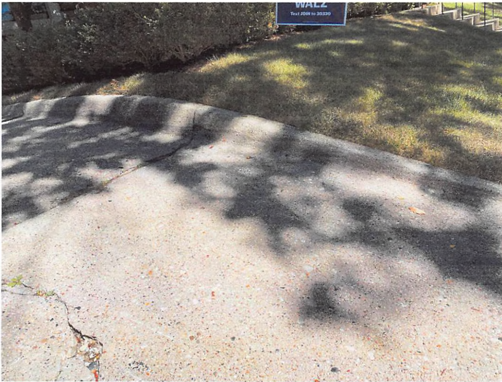
Existing curb of driveway.