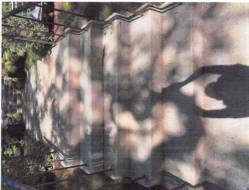
Front steps – cracked with railing that has become unstable.