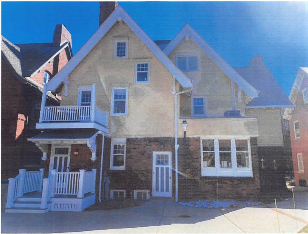
Rear of house