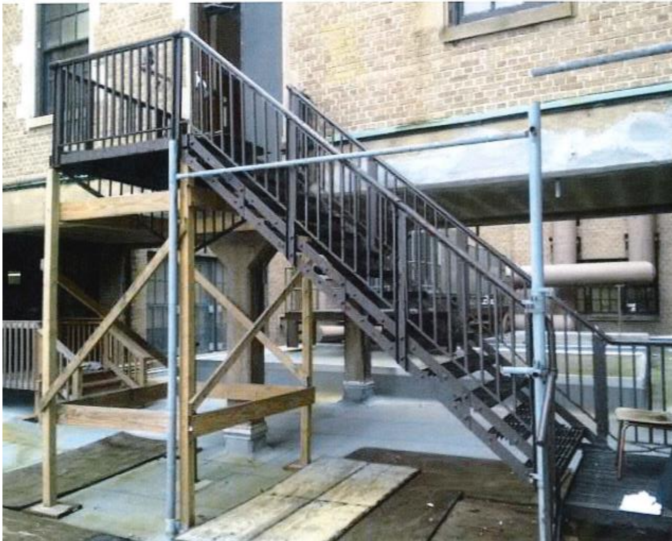
Close up of current fire escape.