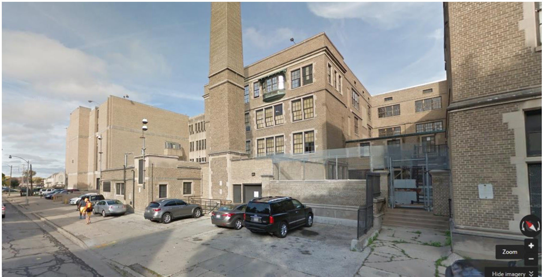
View of portion of Washington High School from 44 th Street.