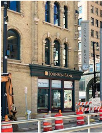
Existing double face sign [ opposite side is identical ]