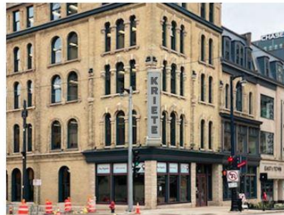
Rendered with proposed face change