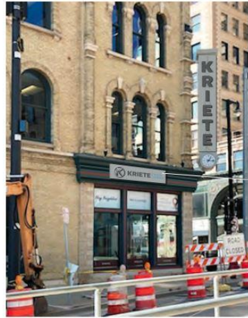
Rendered with proposed face change