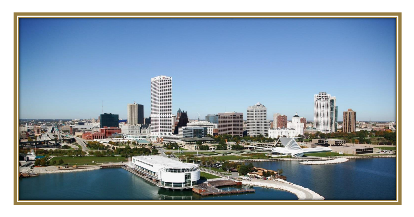
2013 Annual Report Expenditures & Activity through December 31, 2013 Department of City Development