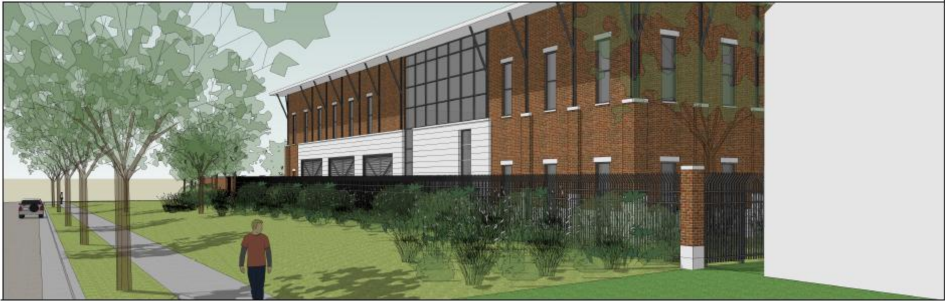
1 VIEW LOOKING NORTHWEST FROM WEST STATE STREET