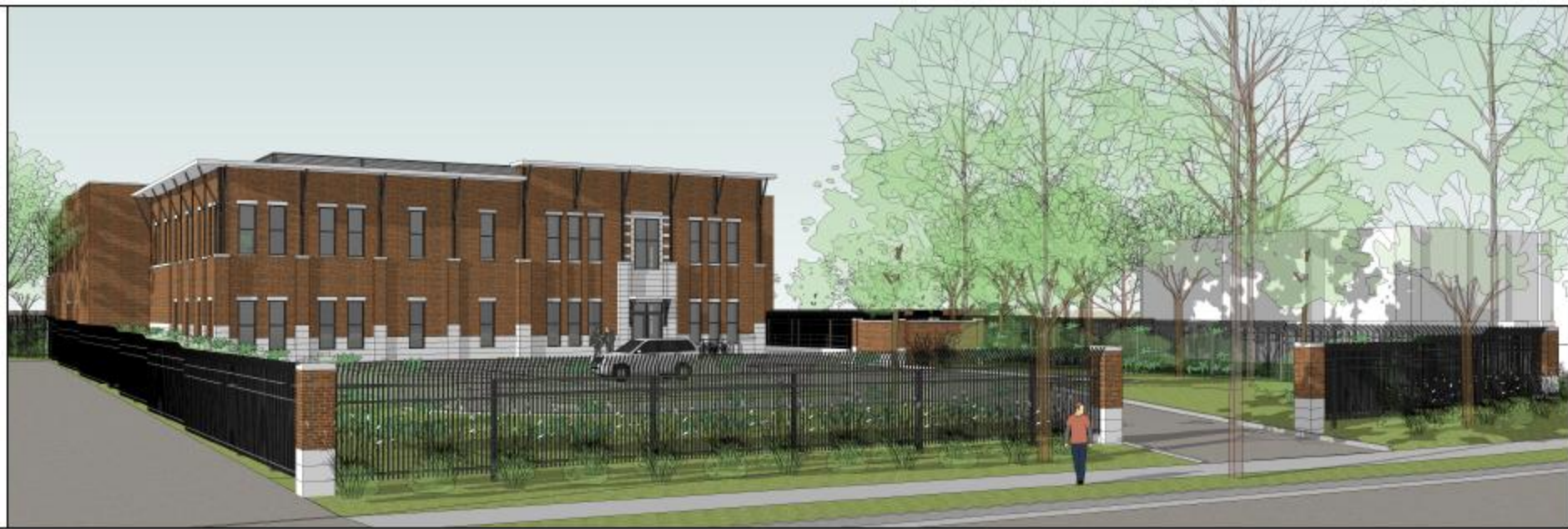
2 VIEW LOOKING SOUTHWEST FROM HIGHLAND BOULEVARD