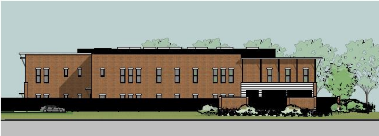
2 PROPOSED WEST ELEVATION 3/32" = 1'-0" FOREGROUND TREES OMITTED FOR CLARITY