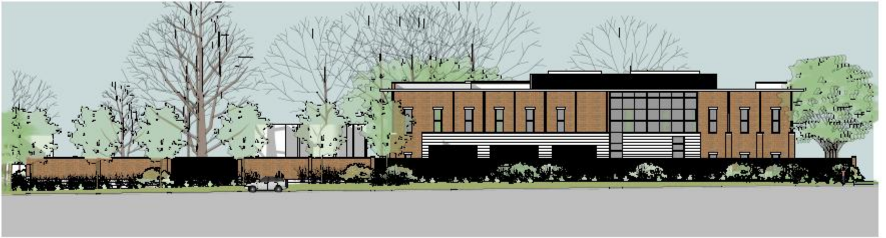
1 PROPOSED SOUTH ELEVATION 3/32" = 1'-0" FOREGROUND TREES OMITTED FOR CLARITY