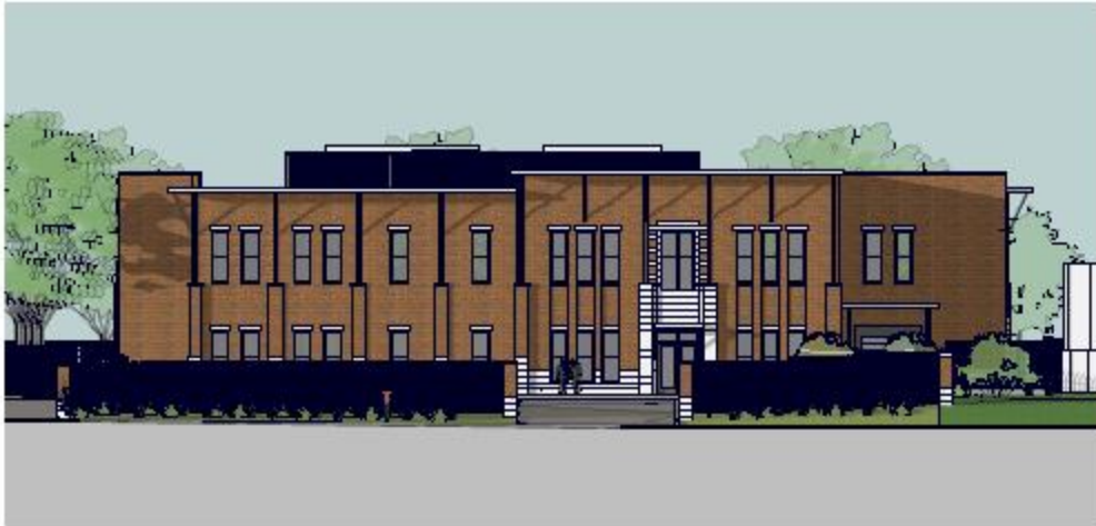
1 PROPOSED NORTH ELEVATION 3/8" = 1'-0" FOREGROUND TREES OMITTED FOR CLARITY