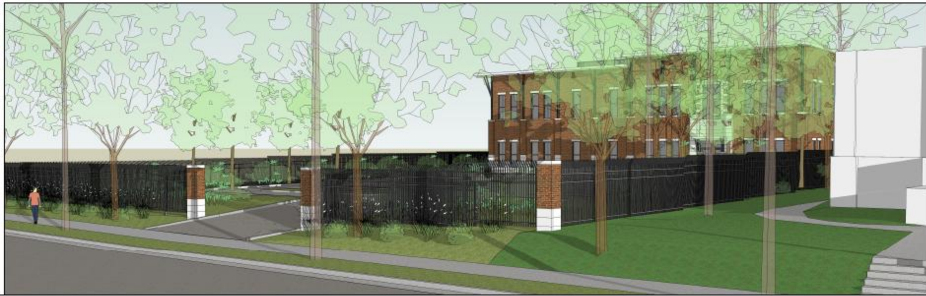
1 VIEW LOOKING SOUTHEAST FROM HIGHLAND BOULEVARD, LION HOUSE AT RIGHT