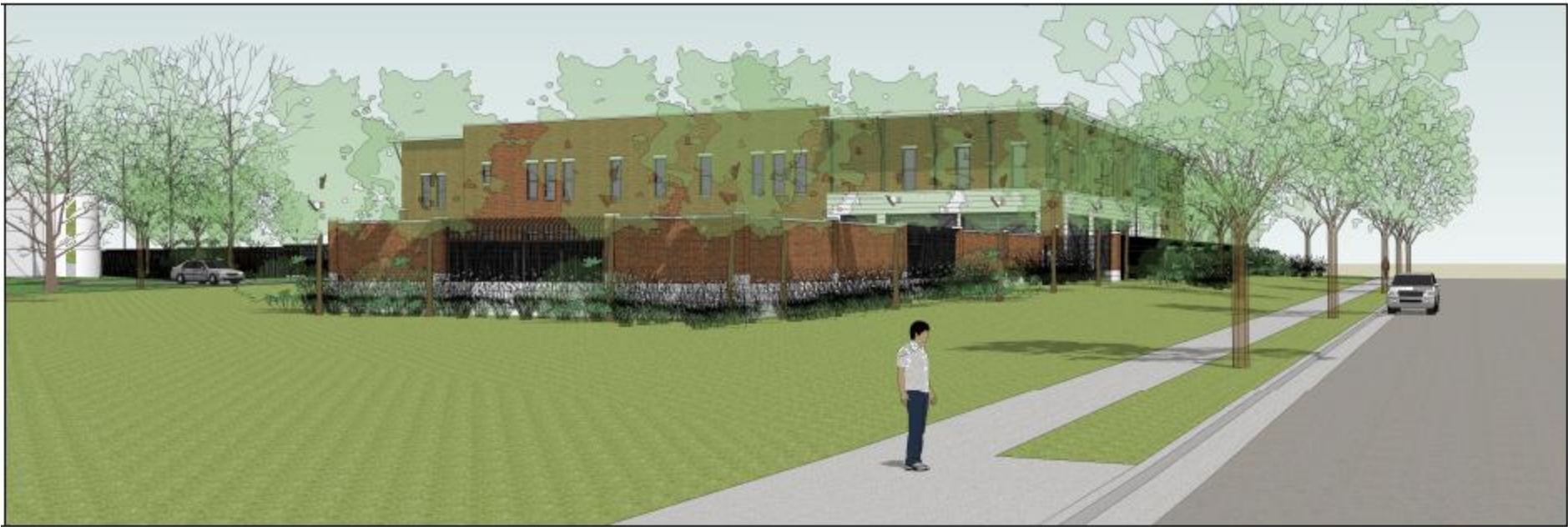
2 VIEW LOOKING NORTHEAST FROM WEST STATE STREET