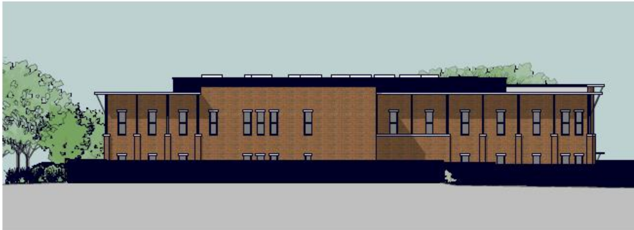
2 PROPOSED EAST ELEVATION 3/8" = 1'-0" FOREGROUND TREES OMITTED FOR CLARITY