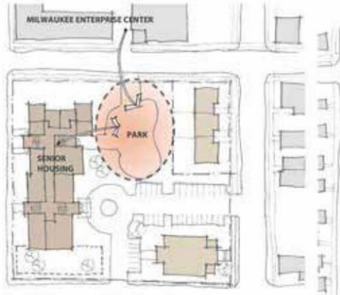
Fifth Street School | MLK Charrette