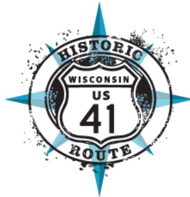
Historic Route 41 Business Improvement District