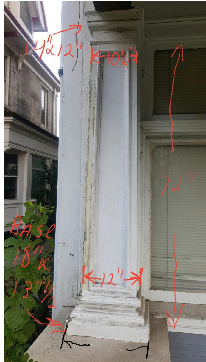
Detail photo of extant pilaster. New columns shall replicate this.