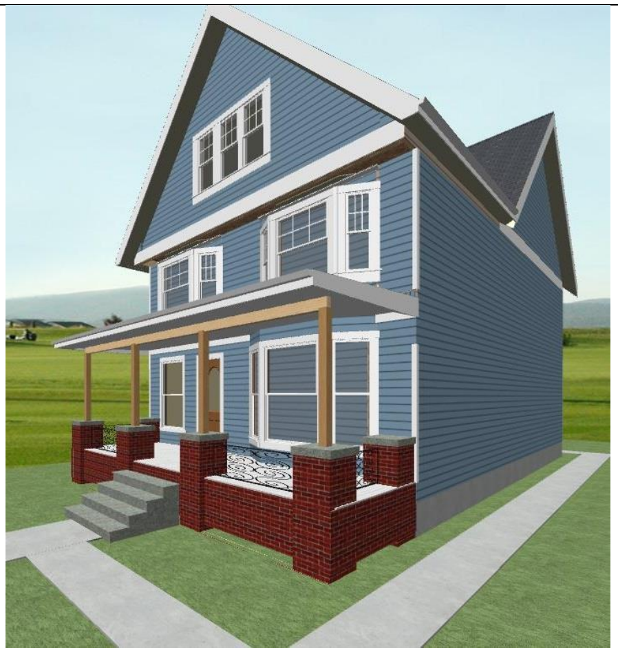
NW perspective view