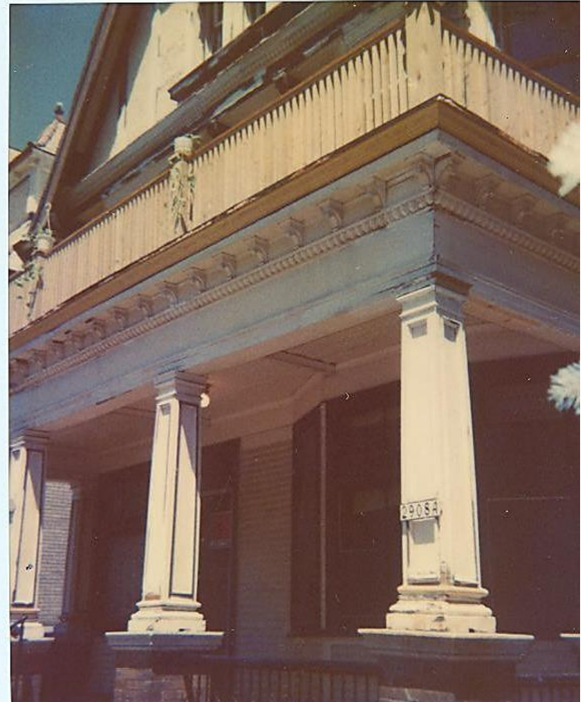
Deteriorated columns, date unknown (c. 2007).