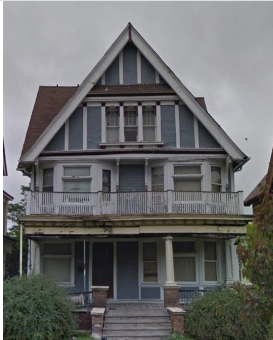
Current conditions with round column that was denied at the October 2015 meeting.