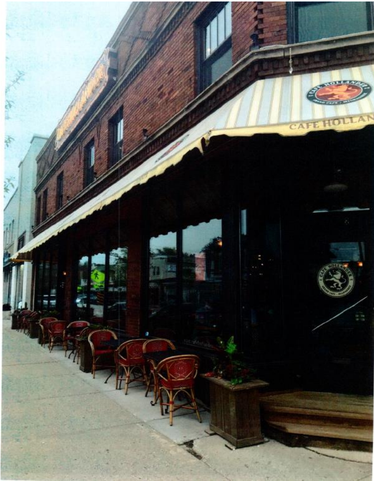
West elevation along Downer Ave