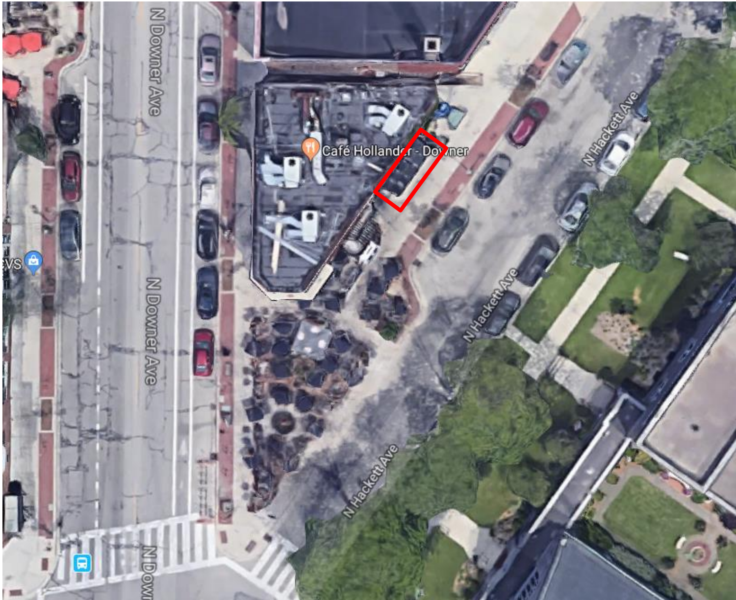
Approximate location of proposed fence/corral