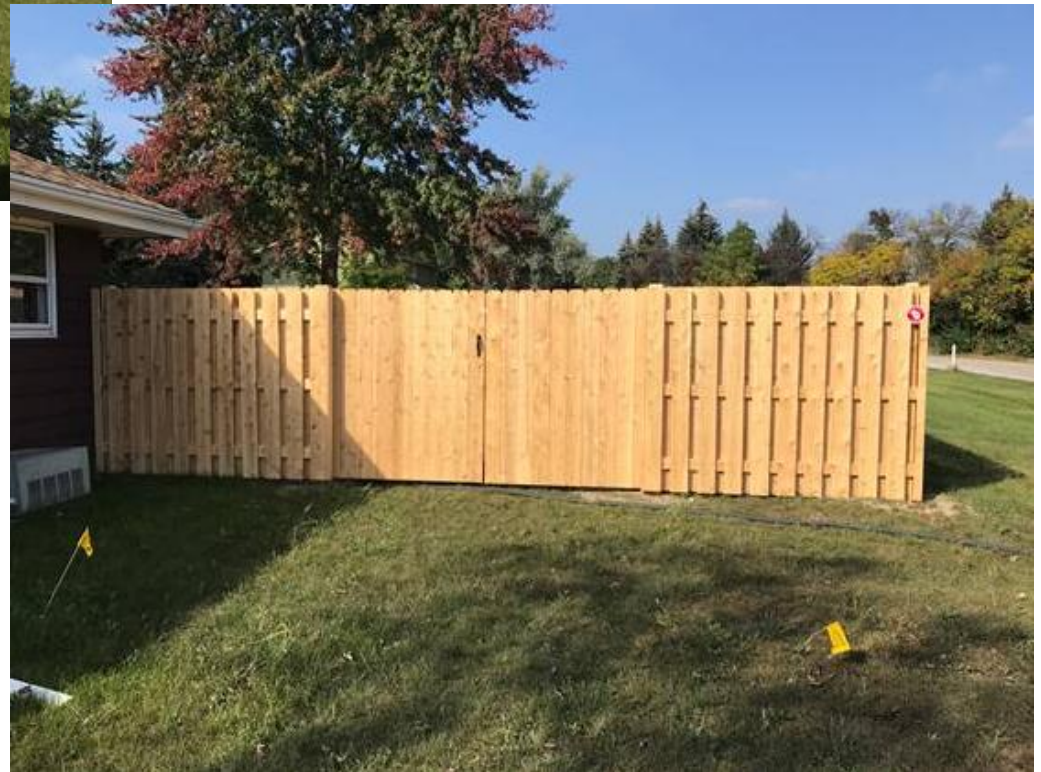
Image at right is to indicate gate and posts only. The shadowbox style fence is not permitted.

Fence design (6' high dog ear) will resemble the image above but include a 12'x6' double drive gate that resembles the photo to the right ( paint or opaque stain required )