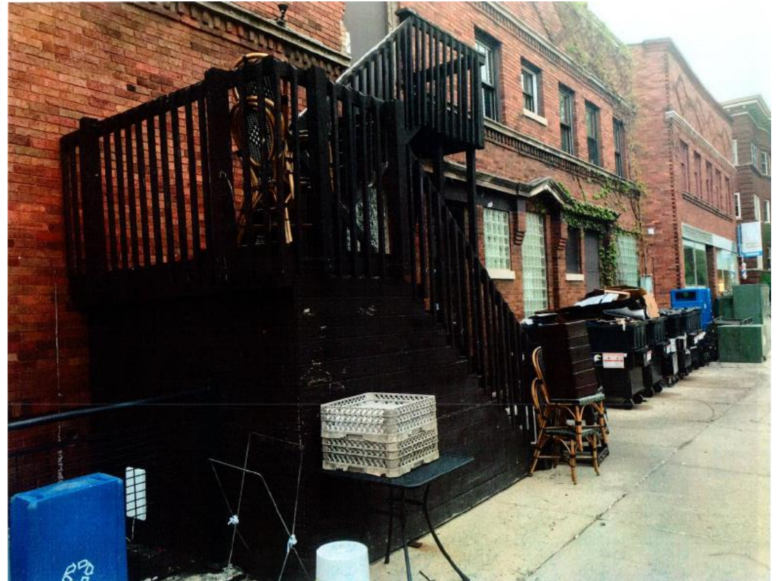
East Elevation along Hackett Ave