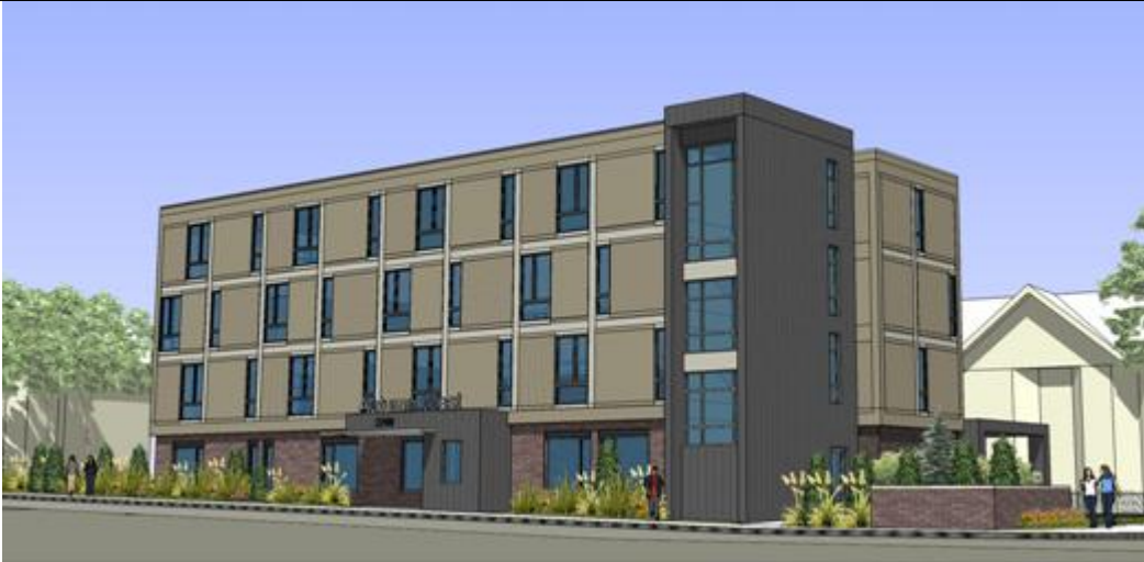
View to the northeast, corner of 34 th and Lisbon

Construction of 21, one-bedroom units of transitional housing. The building will contain apartments, offices, kitchens and community rooms. Trash pick-up and parking for three vehicles will be provided on the City lot off of Vine Street. Expanded on-site parking and green space will be added to the project should adjoining lots be acquired. A shared parking agreement also has been reached with the property owner directly to the south. Estimated construction costs are approximately $2.6 million with EBE participation projected to be 25%. The project will be funded in large part by a Department of Commerce allocation relating to affordable rental housing.