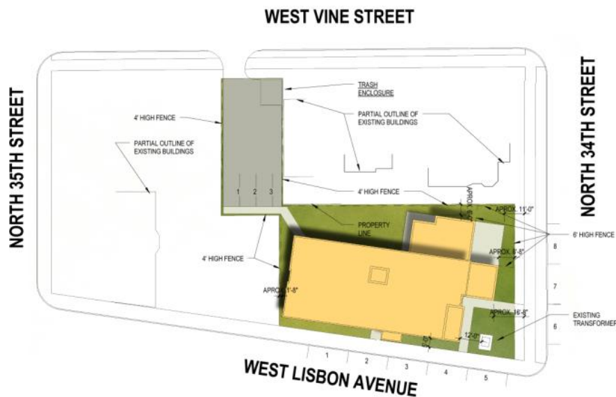
Preliminary Site Plan