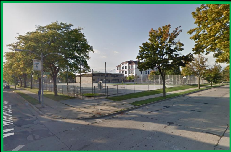
View northwest from West Meinecke Ave and North 19 th St