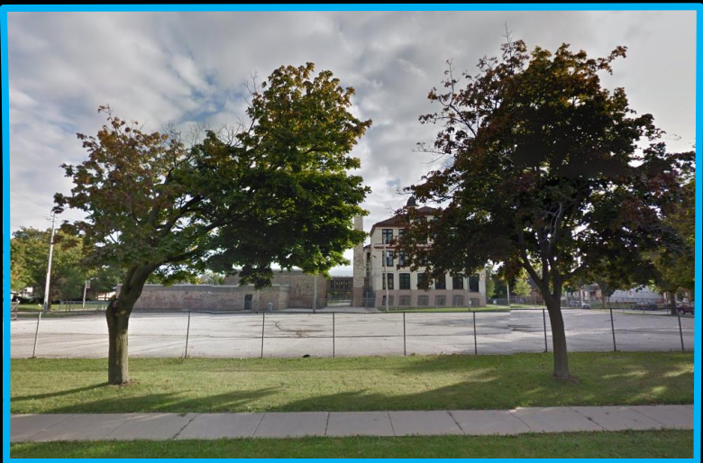
View south from West Wright St