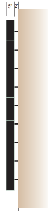
SIDE VIEW NTS