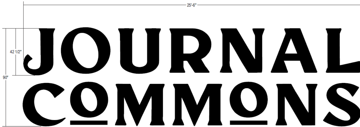
FRONT VIEW 3/8" = 1'-0"