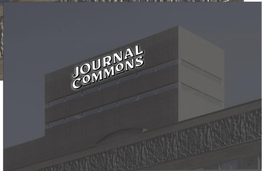
NIGHT VIEW SCALE: NTS