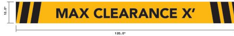
Clearance Marker Wall Sign 1 / WS1, 12"H x 120"W, ACM w/ Vinyl Face, Text TBD QTY: 1 - 1 North Entrance