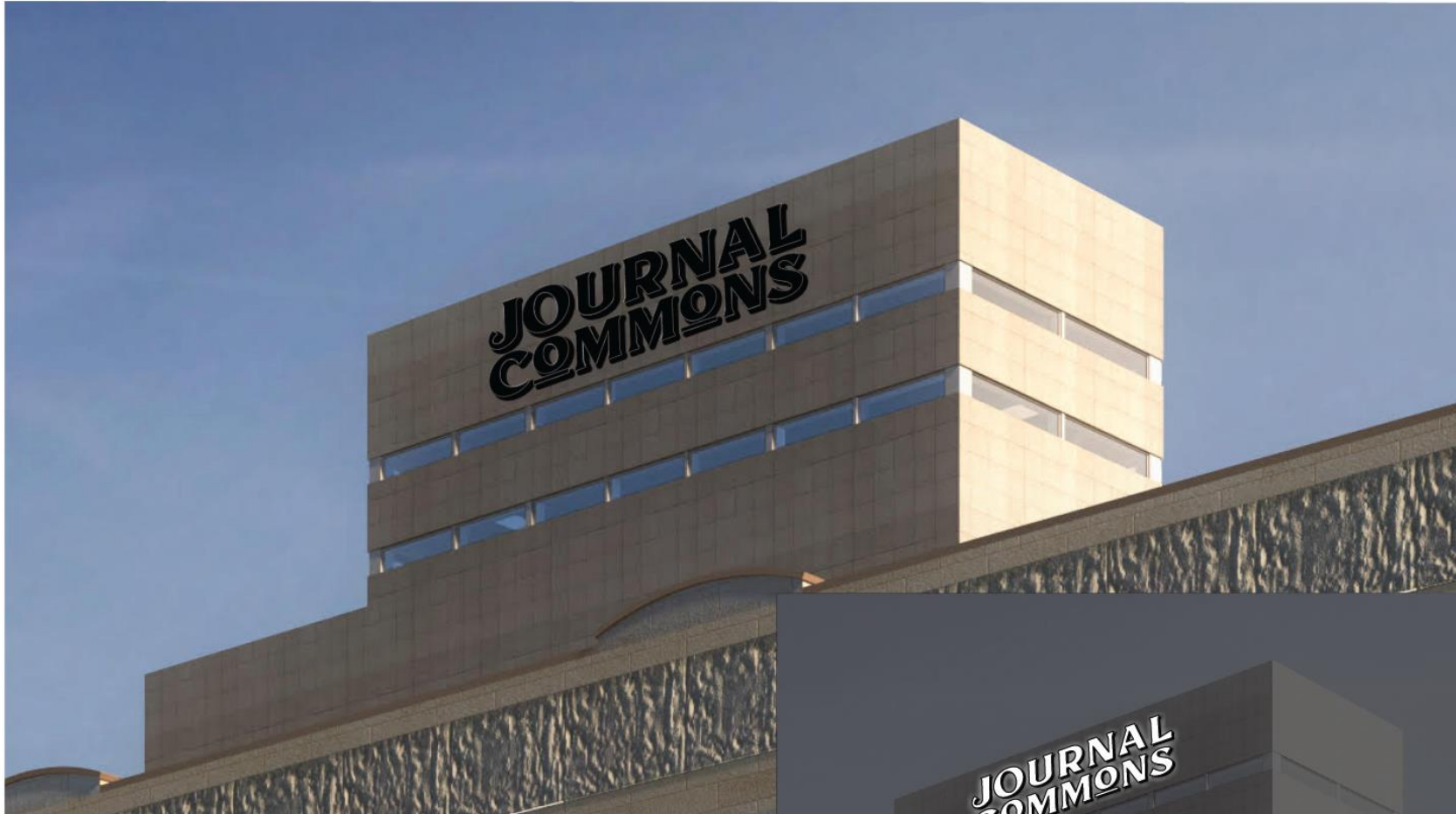
PROPOSED FRONT ELEVATION VIEW W/ NEW CHANNEL LETTERS SCALE: NTS