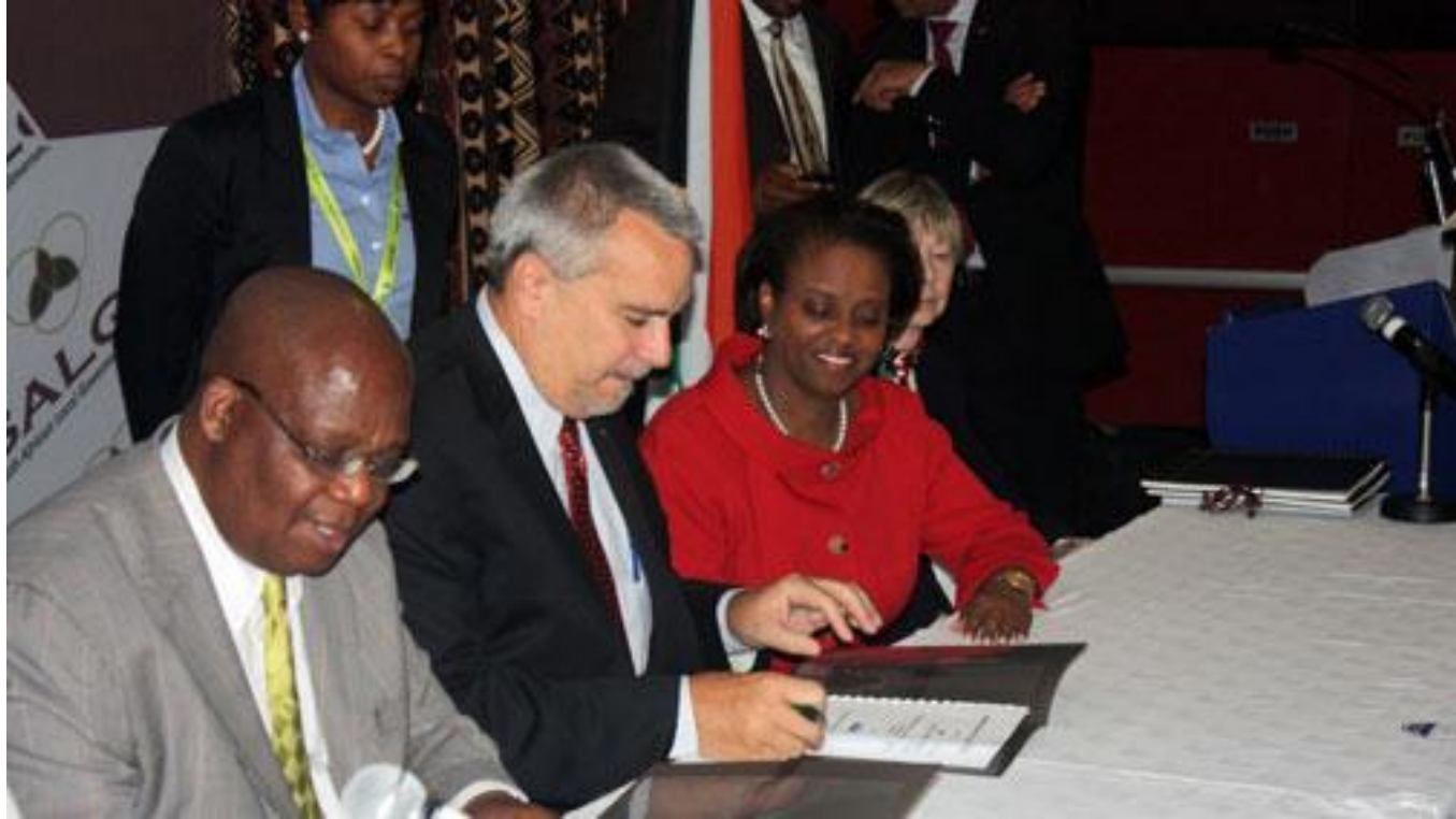
SALGA President, NLC Past President & Special Representative for Global Intergovernmental Affairs at U.S. Department of State