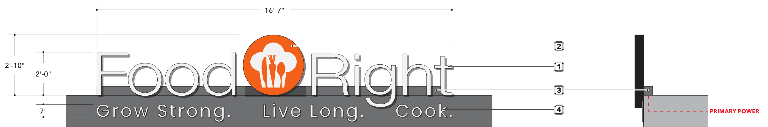
3 Sign Detail

elevated identity Brand Forward. Experience Driven.