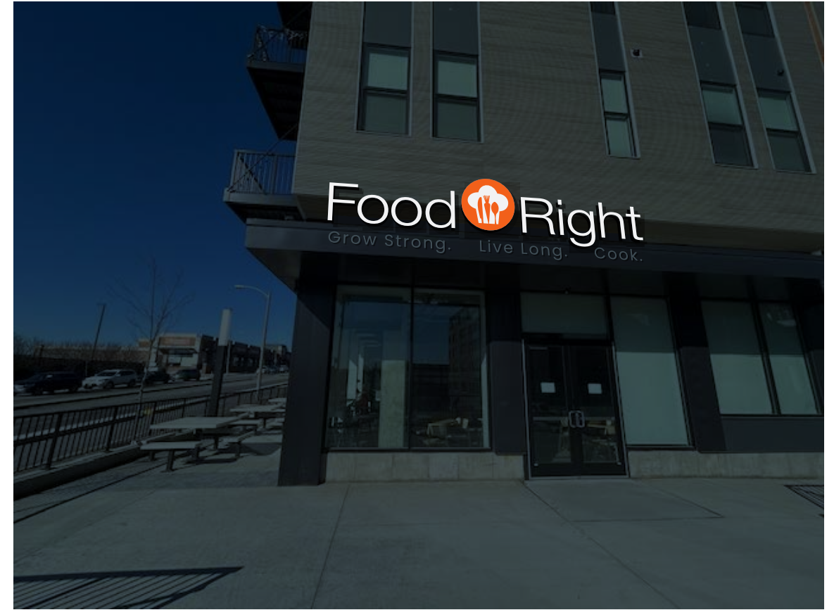
2 Proposed Layout NIGHT VIEW