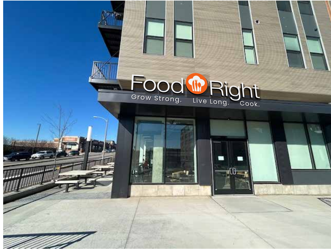
1 Proposed Layout DAY VIEW