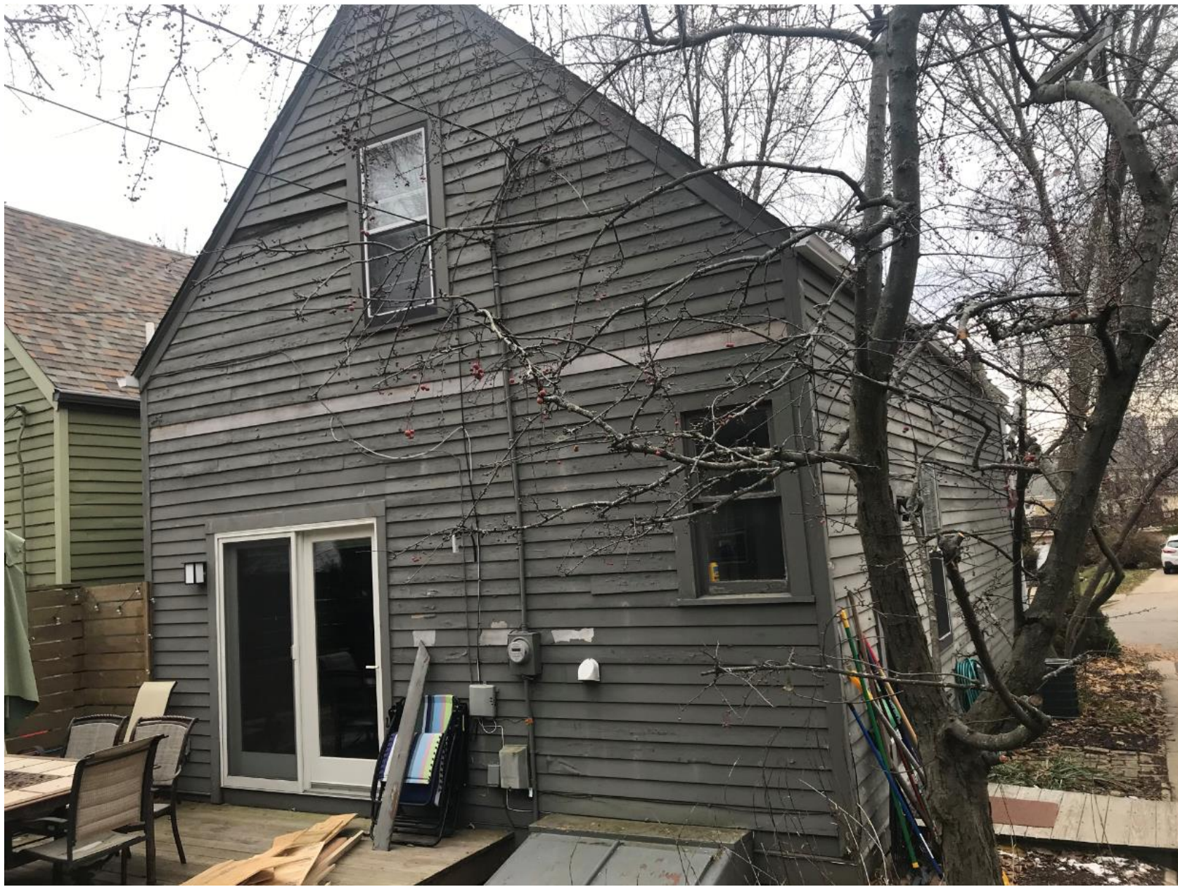
Current condition of the siding on the north elevation – will be replaced with pine of the same width as existing and entire