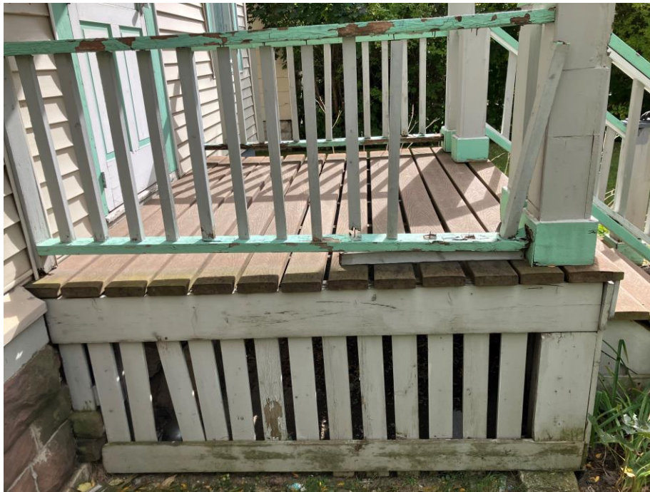
Existing porch conditions