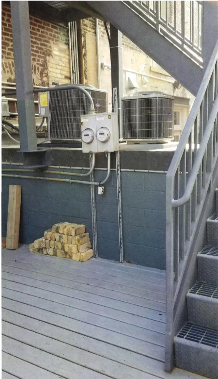
A/C units as installed