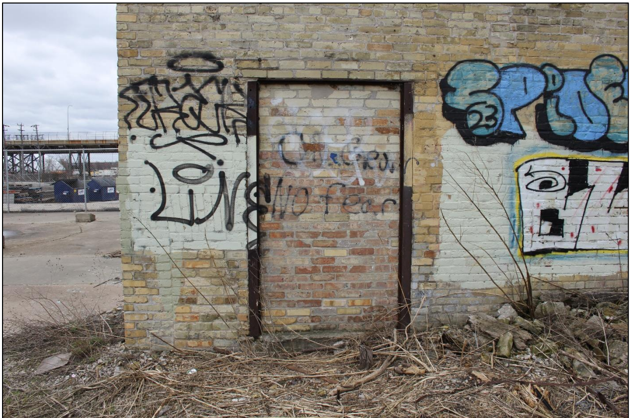
Photo 18 – East elevation brick-infilled opening, view looking west