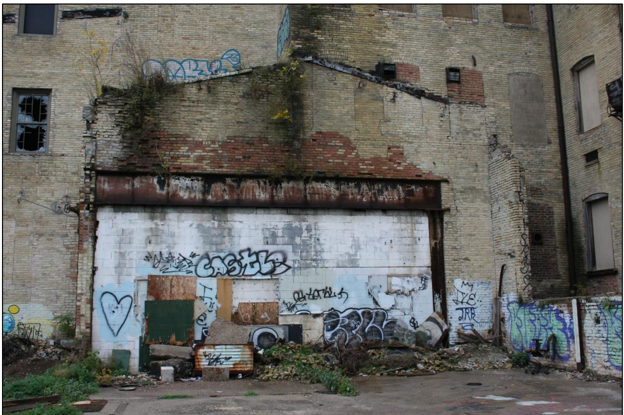
Photo 20 – East elevation, concrete block infilled opening, view looking west