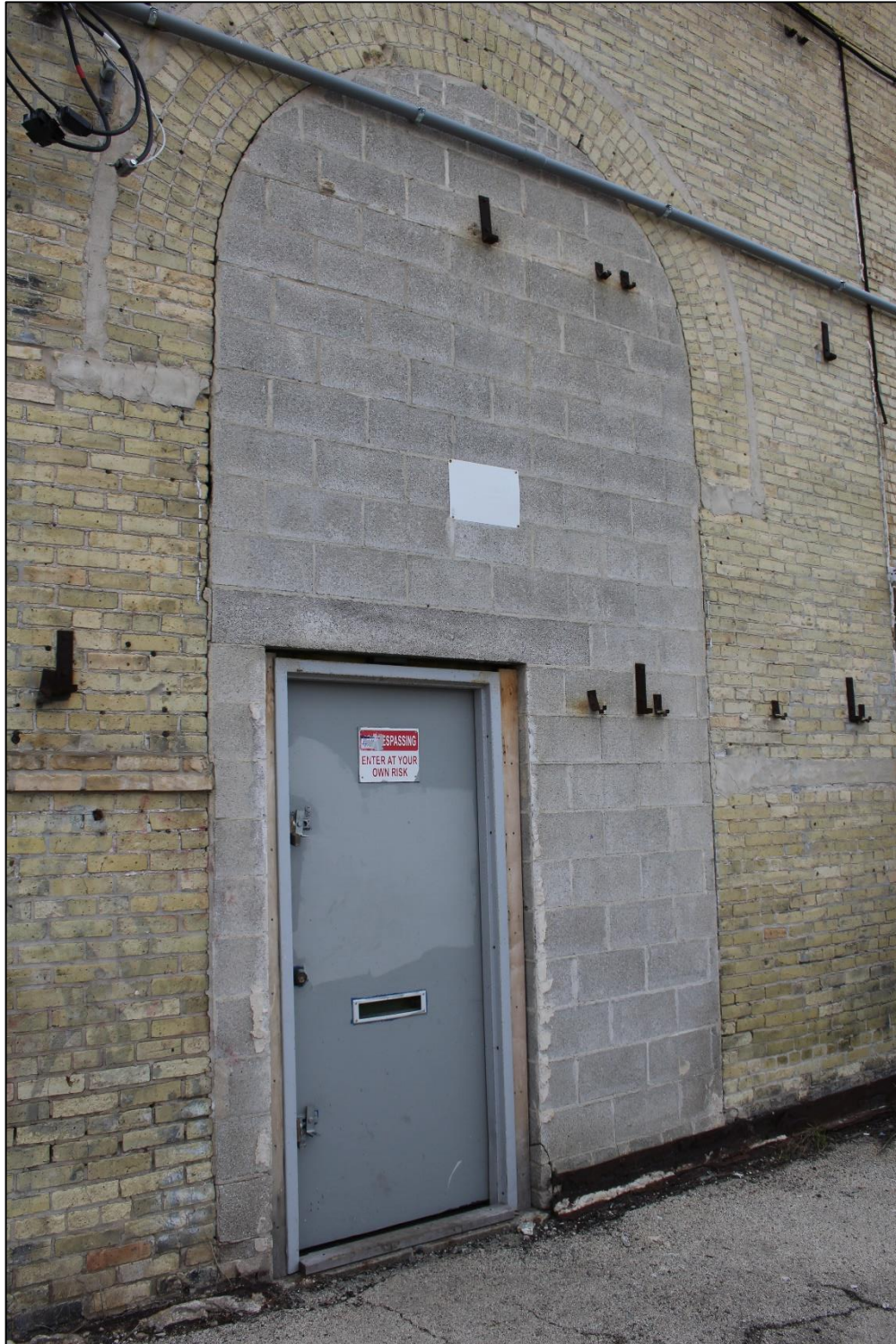
Photo 3 – Primary entrance on west elevation by the building’s northwest corner, view looking southeast