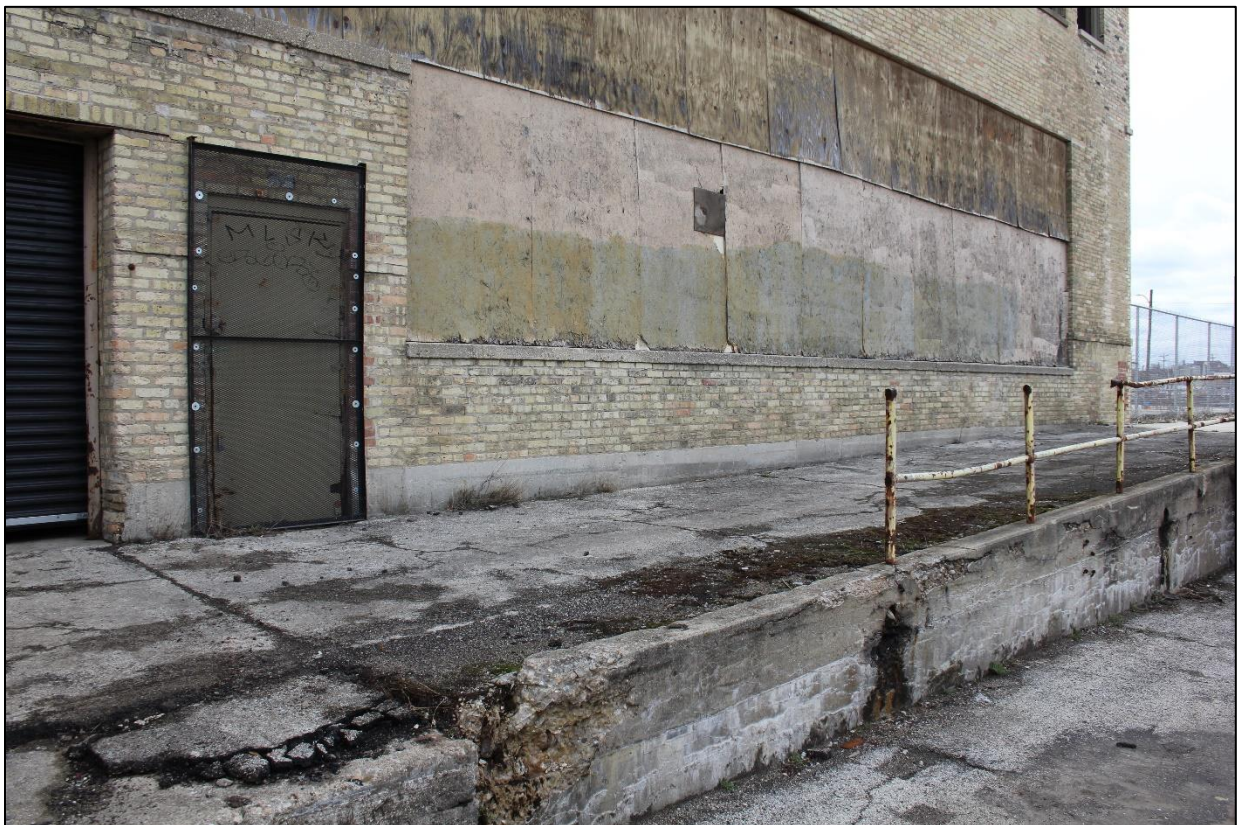
Photo 8 – West elevation, view looking southeast (boarded-over steel sash window & ramp)