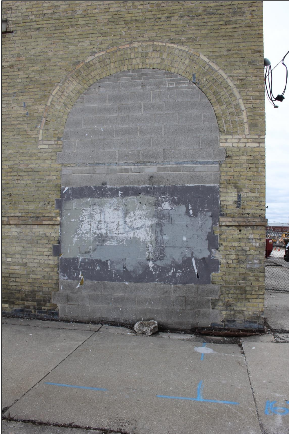
Photo 4 – Round-arched opening around corner from primary entrance. On north elevation by the building’s northwest corner, view looking south