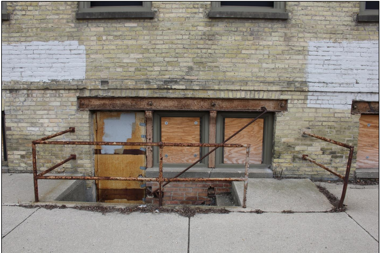
Photo 45 – North elevation basement-level entrance, view looking south