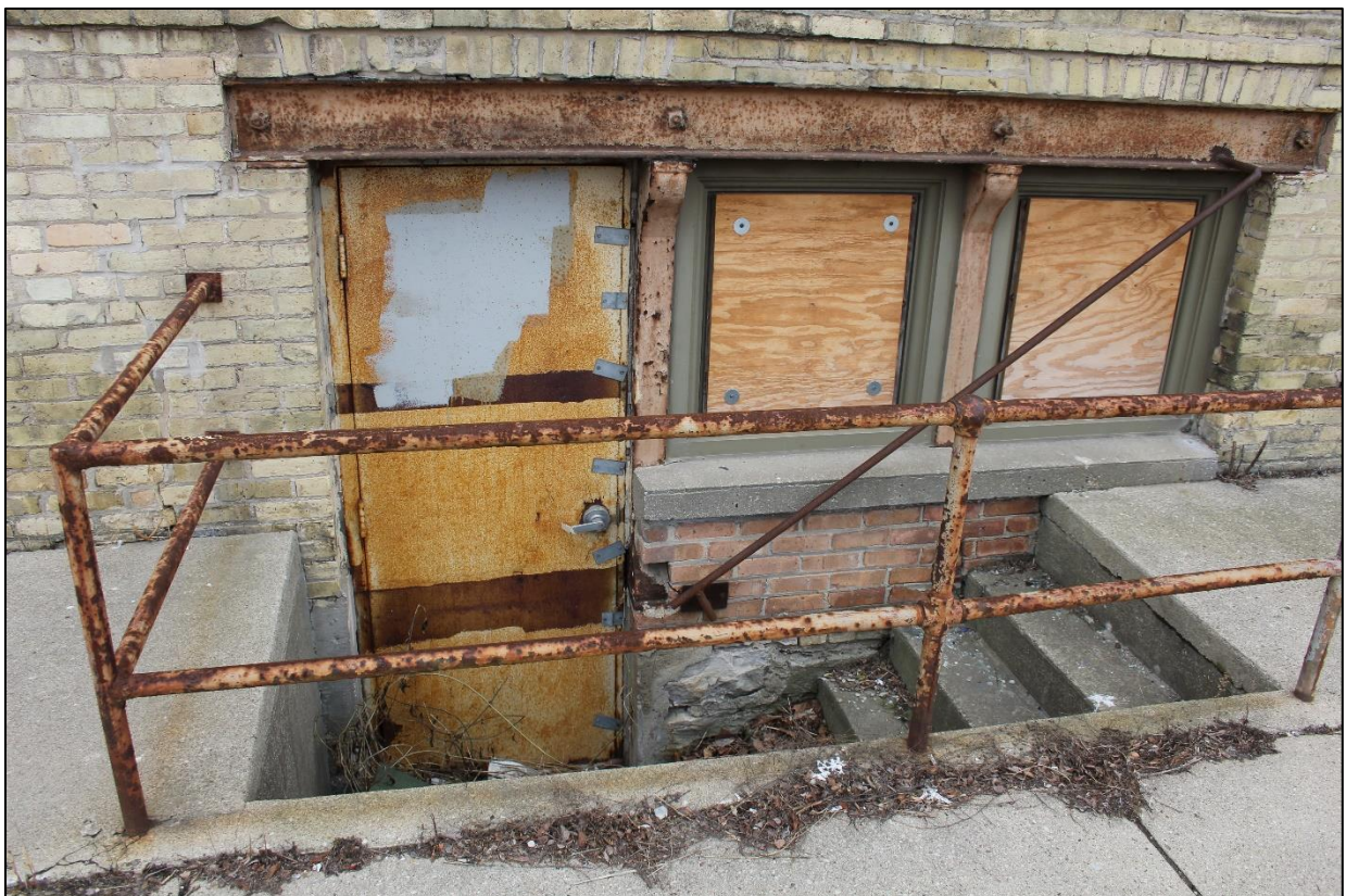
Photo 46 – North elevation basement-level entrance, view looking south