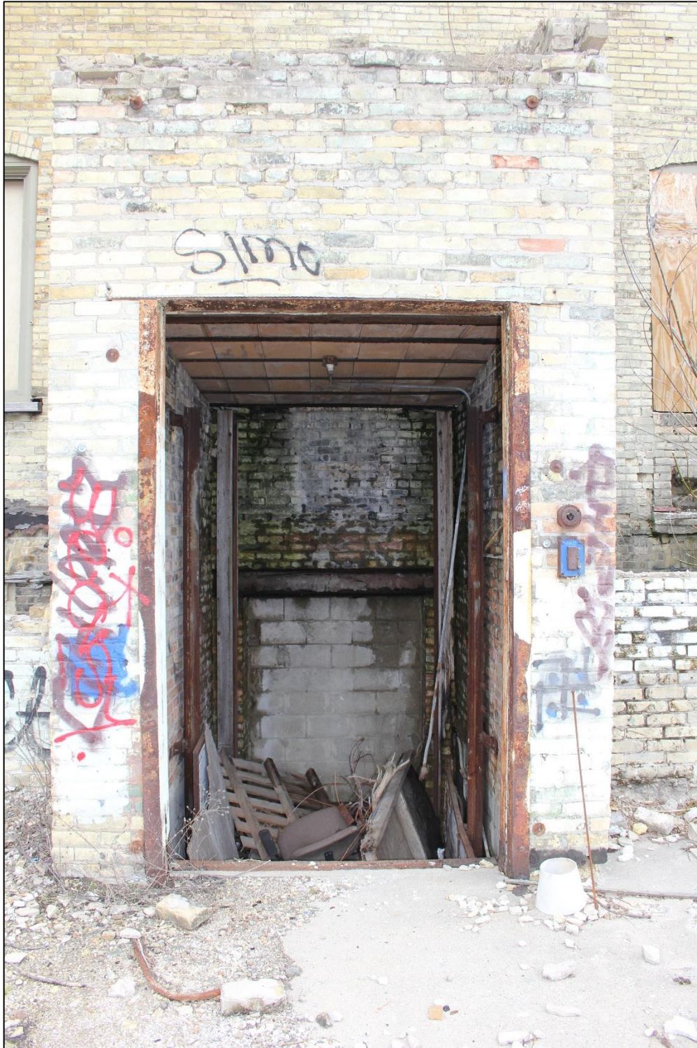
Photo 30 – South elevation, CMU-infilled entrance, view looking north