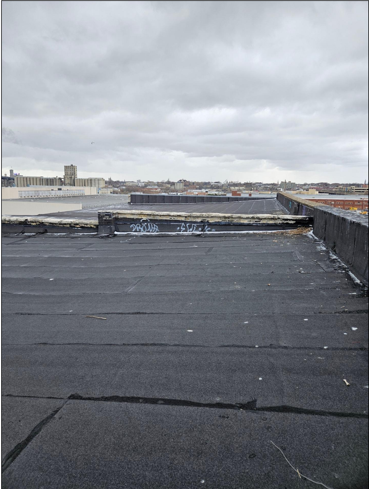
Photo 53 – Roof, view looking south standing at the northwest corner of the building