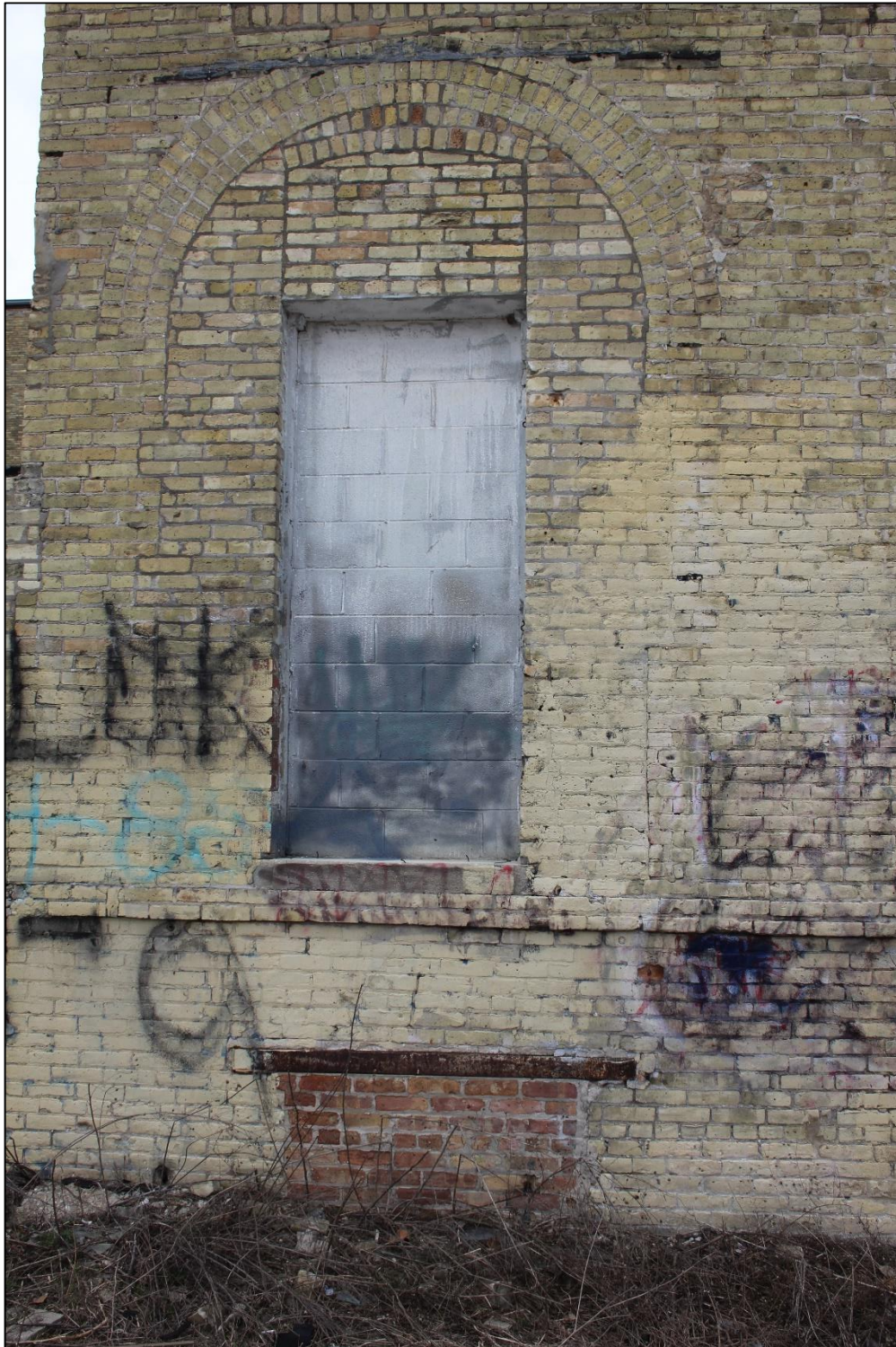
Photo 38 – East elevation, CMU-infilled entrance, view looking west