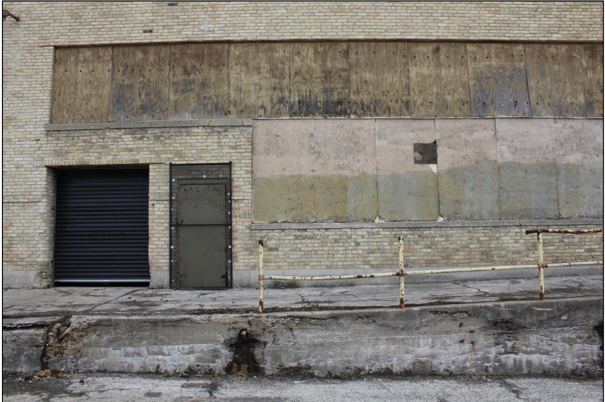
Photo 7 – West elevation, view looking east (boarded-over industrial steel sash window)