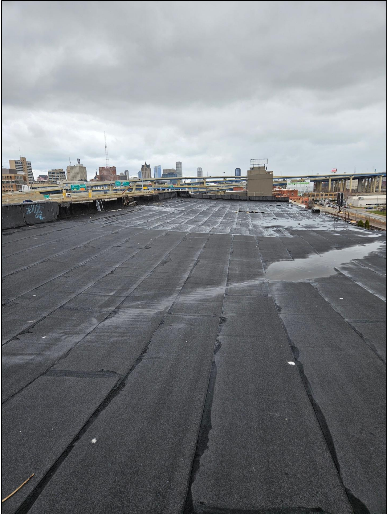
Photo 52 – Roof, view looking east standing at the northwest corner of the building