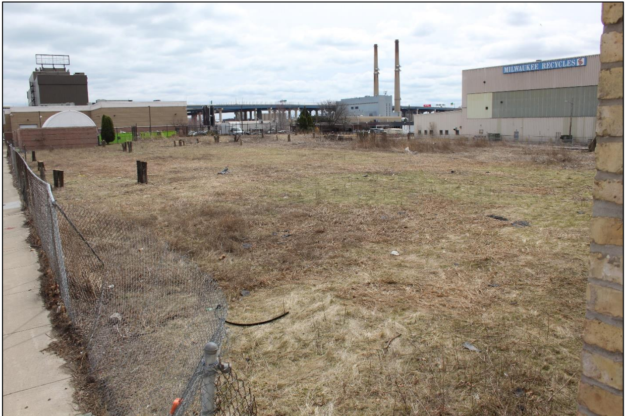
Photo 55 – Area of proposed new construction east of building, view looking southeast