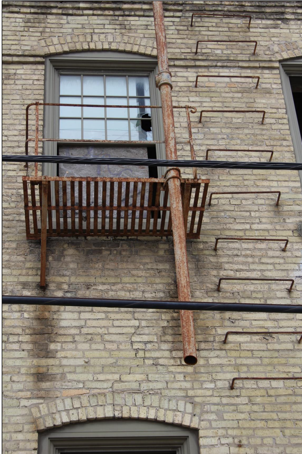
Photo 49 – North elevation, fire escape & standpipe, view looking south