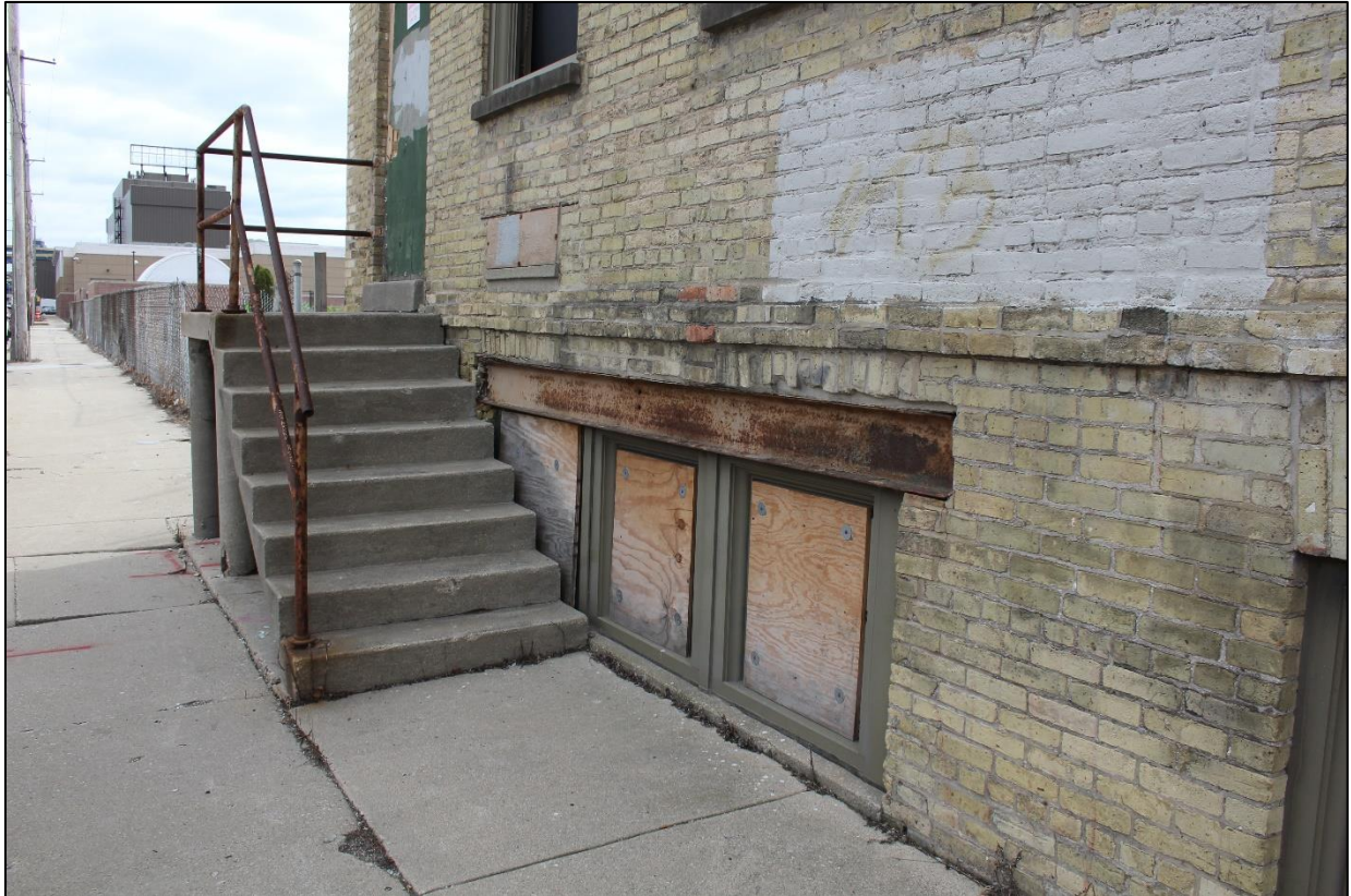
Photo 43 – North elevation secondary entrance stair, view looking southeast