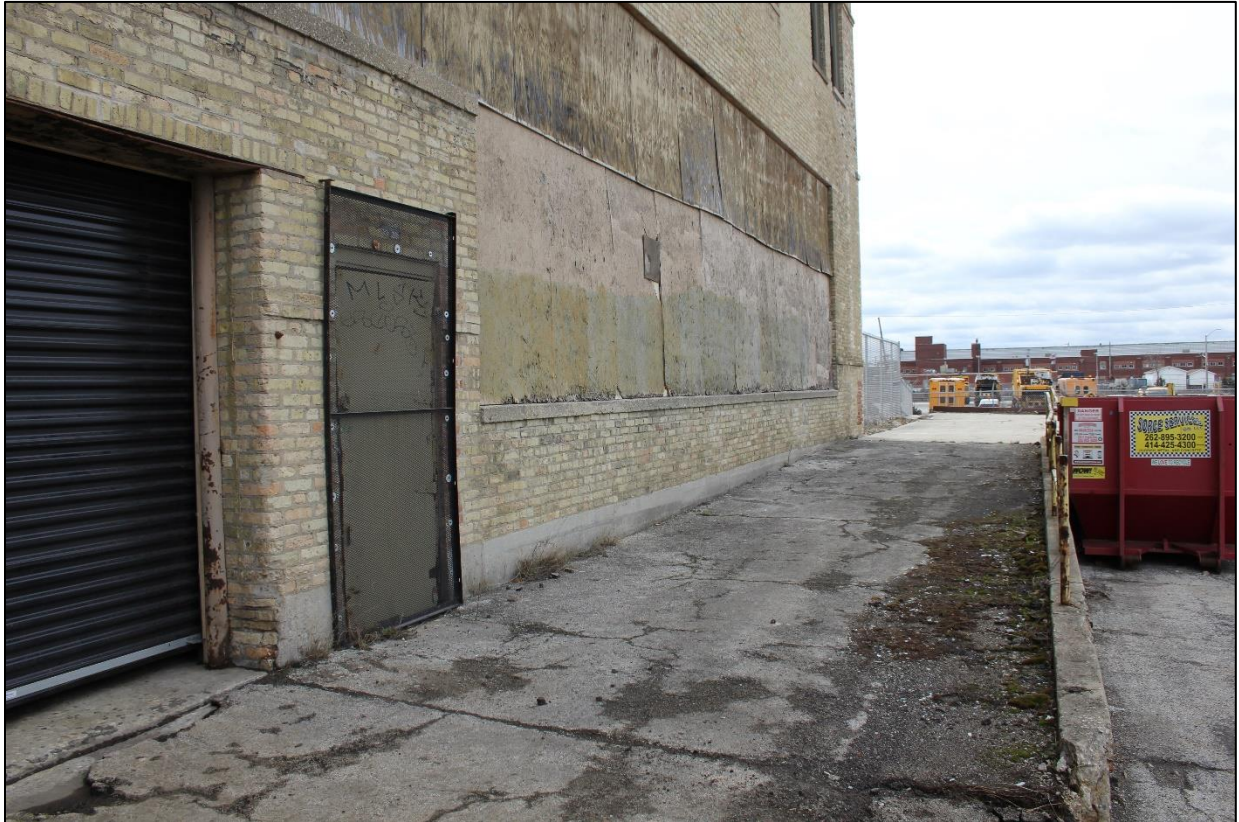
Photo 9 – West elevation, view looking south (boarded-over steel sash window & ramp)