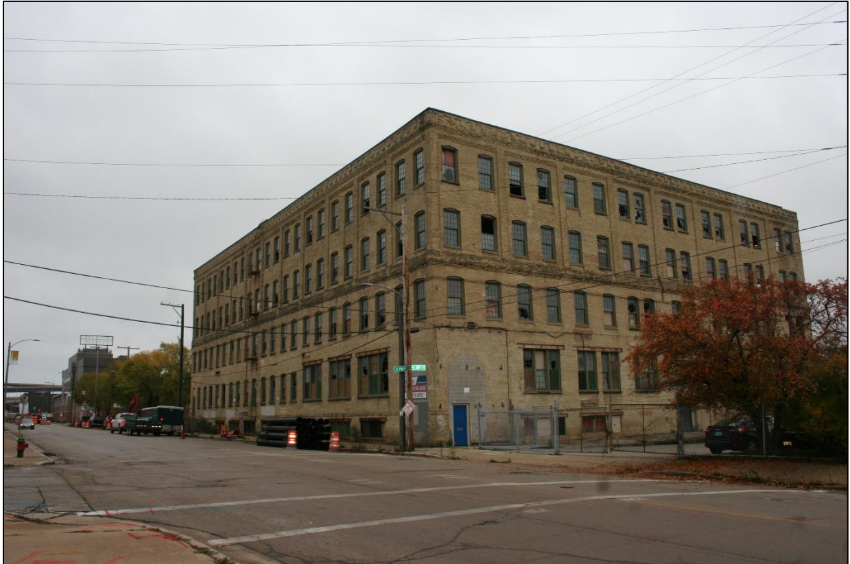
Photo 1 – Context view on W. St. Paul Ave., north & west elevations, view looking southeast