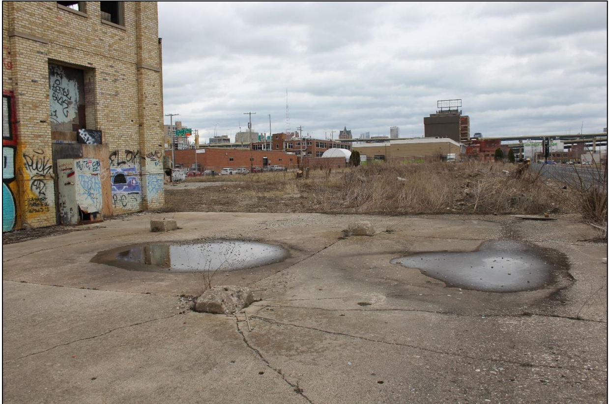
Photo 11 – Concrete pad behind the south (rear) elevation, view looking east