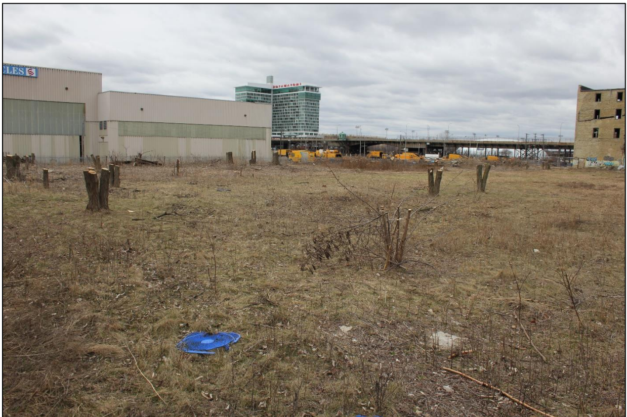
Photo 56 – Area of proposed new construction east of building, view looking southwest