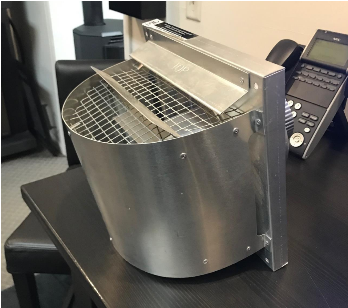
Image of vent.