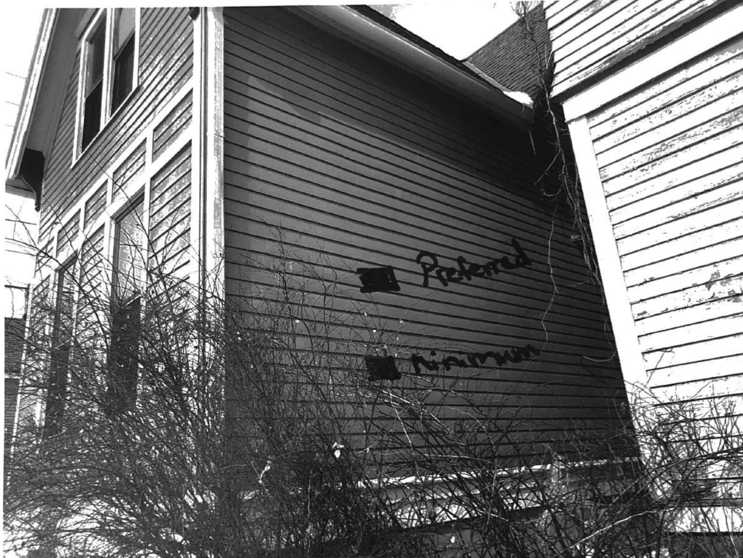
General installation location. Minimum of 7' above grade and no closer to the street than shown.