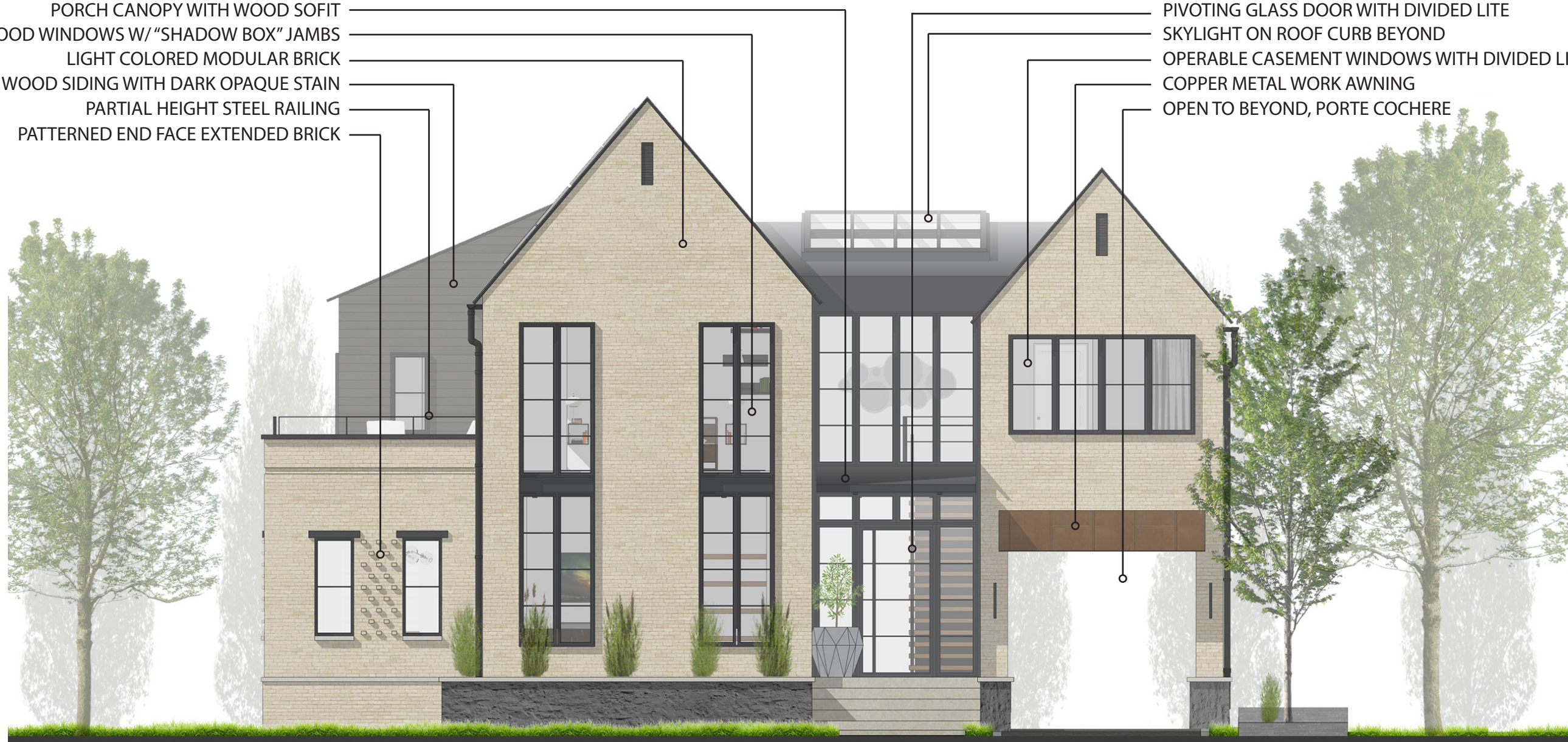
EAST (FRONT) ELEVATION

PIVOTING GLASS DOOR WITH DIVIDED LITE SKYLIGHT ON ROOF CURB BEYOND OPERABLE CASEMENT WINDOWS WITH DIVIDED LITE COPPER METAL WORK AWNING OPEN TO BEYOND, PORTE COCHERE