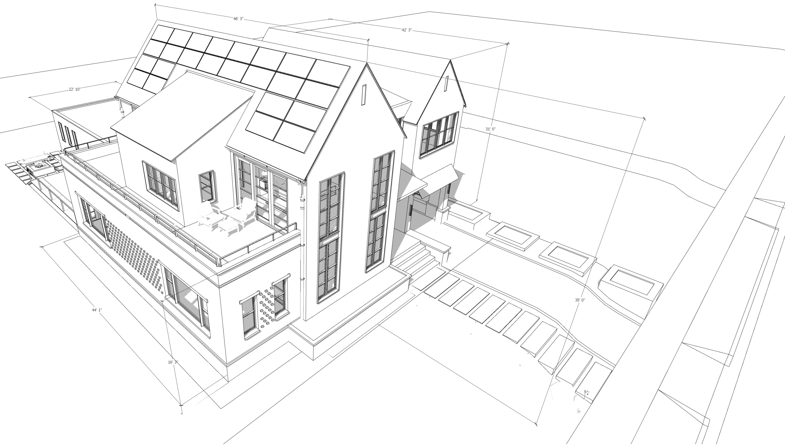
PERSPECTIVE WITH DIMENSIONS