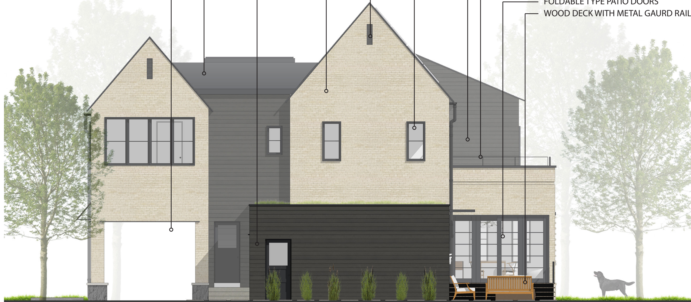
WEST (REAR) ELEVATION

WOOD SIDING WITH DARK OPAQUE STAIN PARTIAL HEIGHT STEEL RAILING FOLDABLE TYPE PATIO DOORS WOOD DECK WITH METAL GAURD RAIL, BEYOND