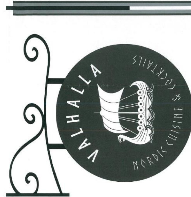
Mounting location and sizes

36" w. x 26" h. digitally printed 11.35 intermediate adhesive vinyl with gloss UV laminate applied to custom routed aluminum panel and mounted to 30" Milano scroll bracket on vertical, non-swinging bars (quantity 2 sides)