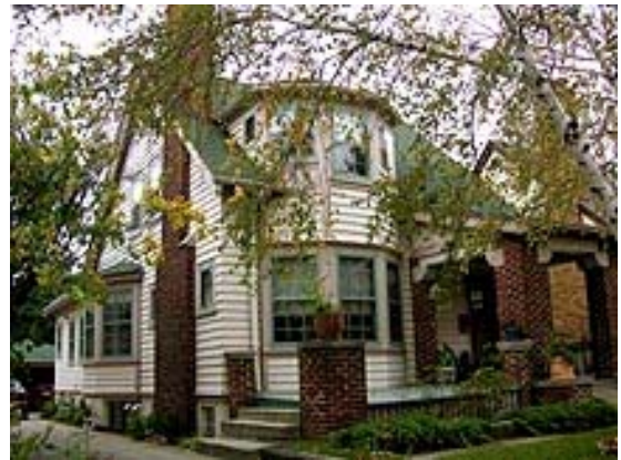
2019 East Kenwood Boulevard