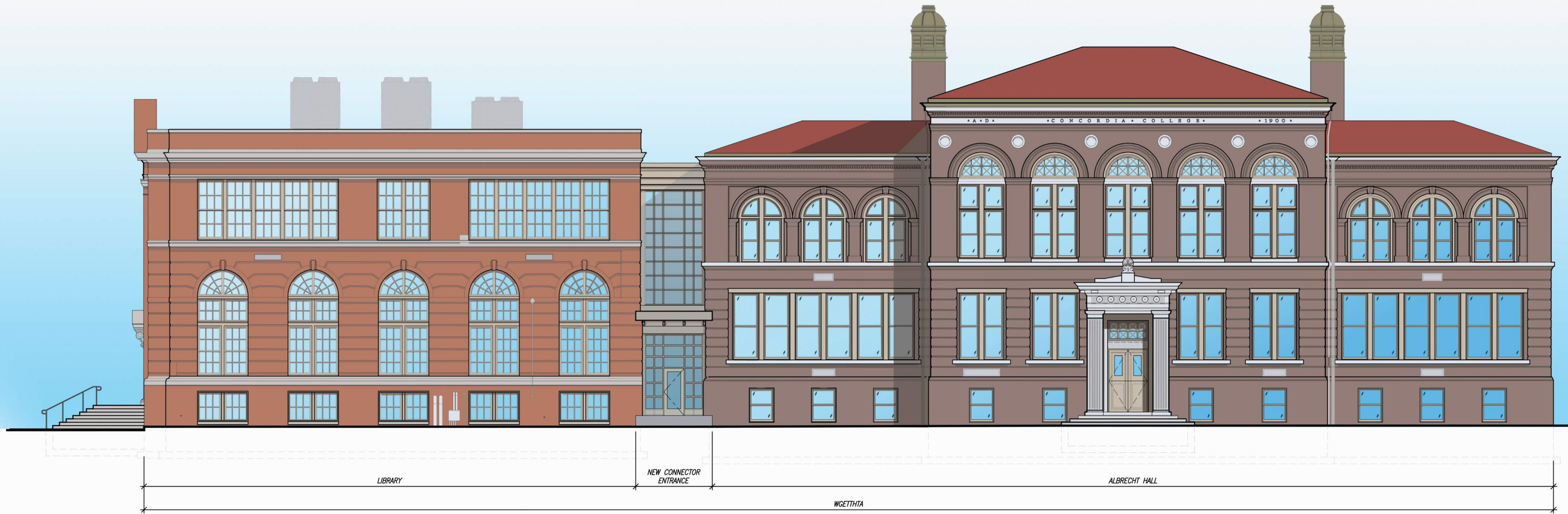
1 SOUTH BUILDING ELEVATION SCALE: 1/8" = 1'-0"