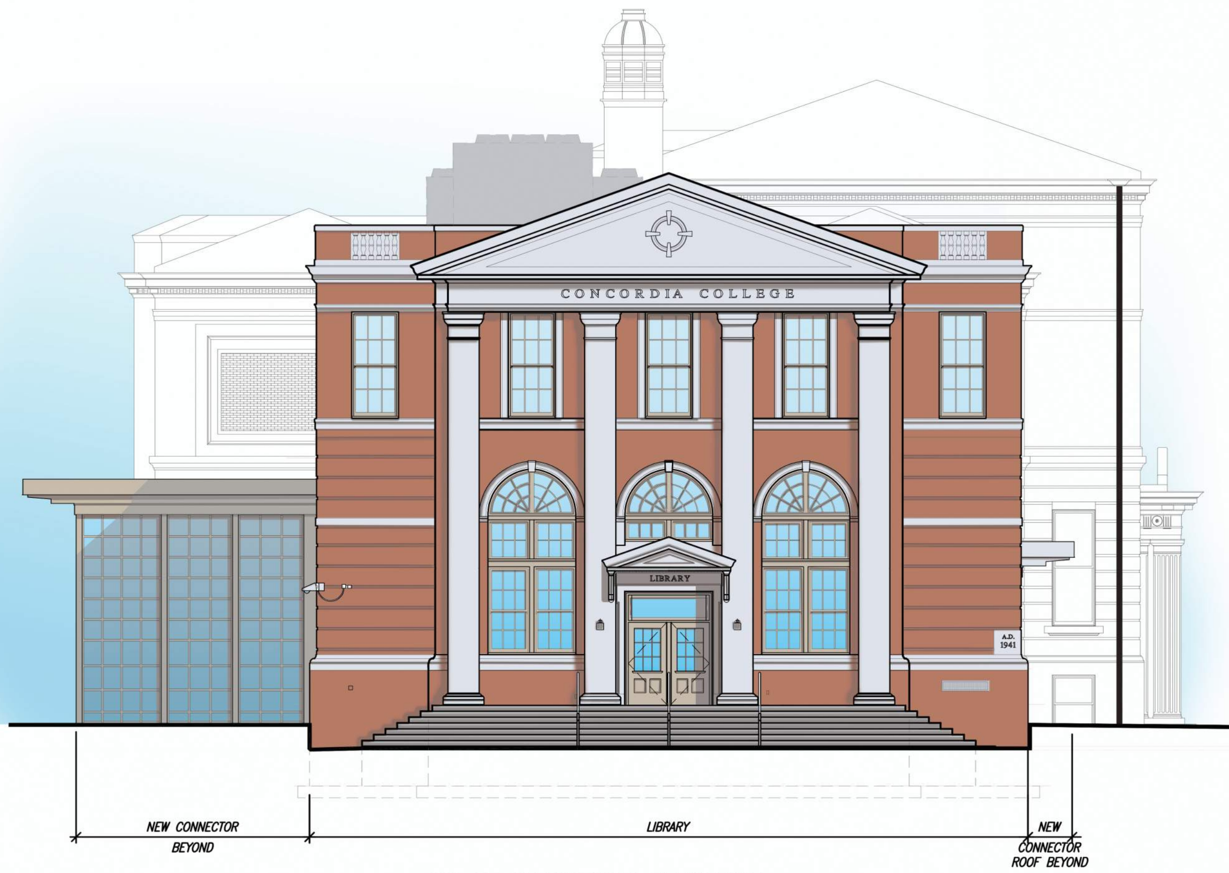
1 WEST BUILDING ELEVATION SCALE: 1/8" = 1'-0"