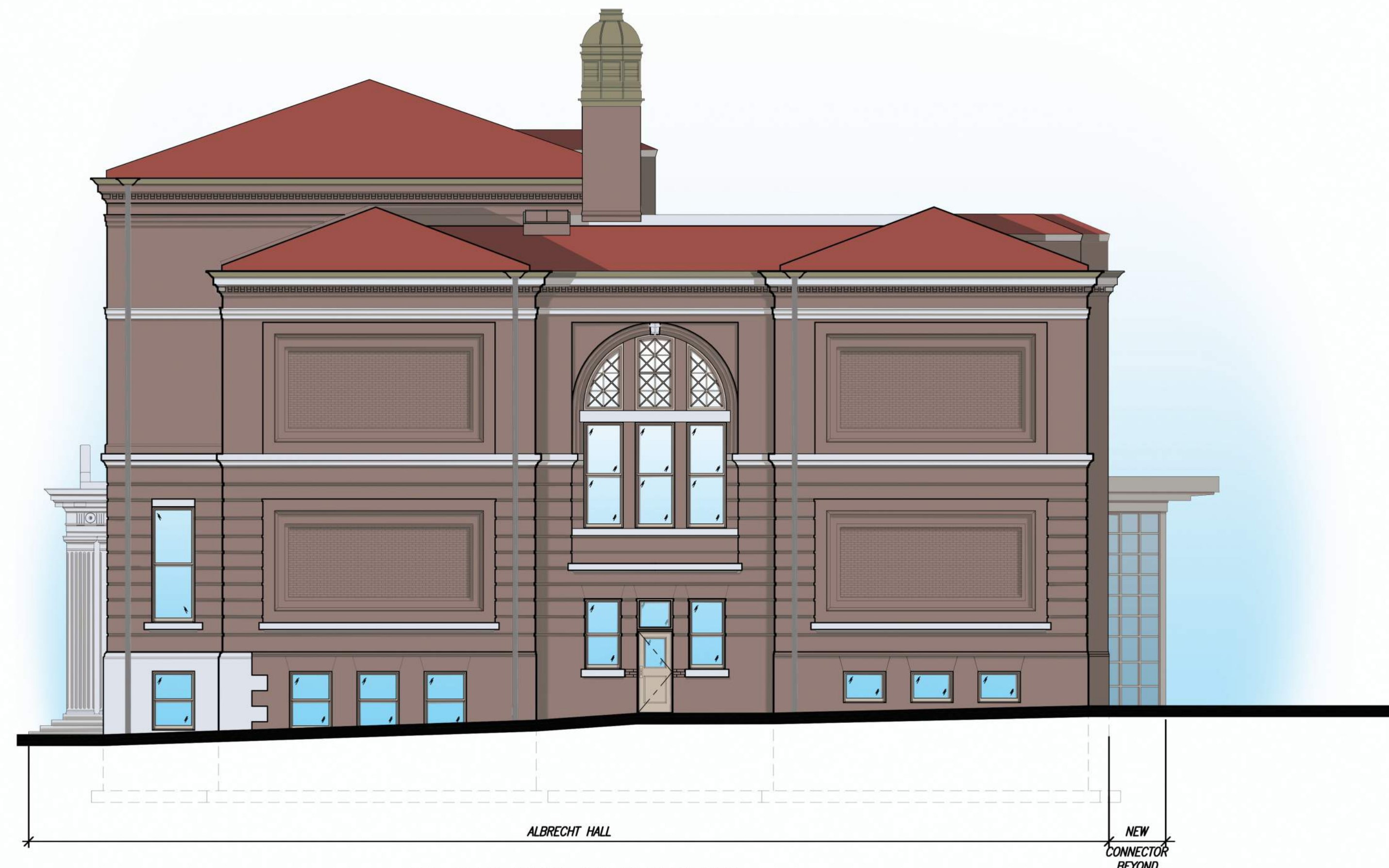
2 EAST BUILDING ELEVATION SCALE: 1/8" = 1'-0"