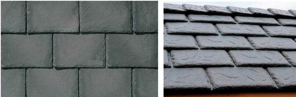
Lamarite (left) and DaVinci (right) are two common synthetic slate products.

Synthetic slate is manufactured in a variety of materials. Some are made of slate and clay with reinforcing from fiberglass and resins. Others are ceramic based, while others are from recycled post-industrial rubber and plastic. The “greenness” of these materials varies as do their profiles and overall compatibility with historic slate.