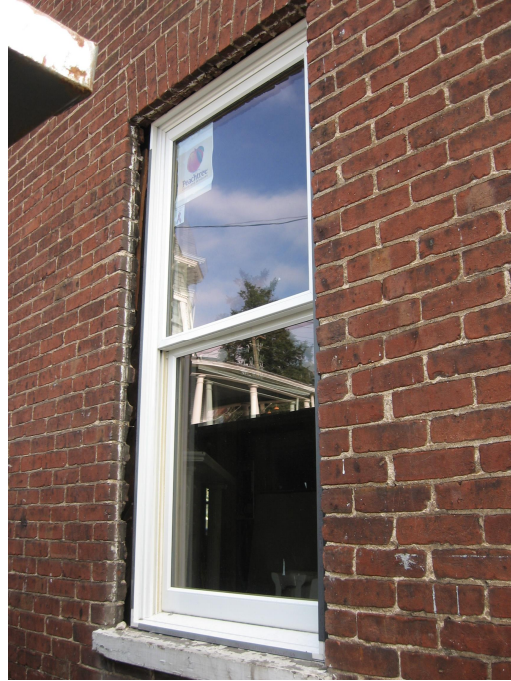
Example of a vinyl clad window approved by the Commission in Roanoke, Virginia