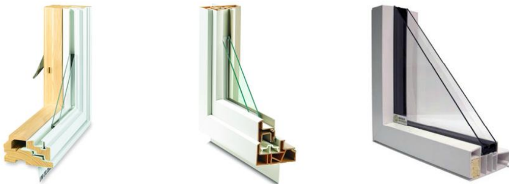
Alternative materials for windows include vinyl clad (left), vinyl (center) and fiberglass (right).

Relatively new on the market are windows made of composite materials such as fiberglass and wood and vinyl and wood. These windows are considered to be “greener” than vinyl, vinyl clad or aluminum clad windows since they use recycled materials. These windows typically have more of a “matte” finish than the bright plastic appearance associated with vinyl and vinyl clad windows. Since these materials are of recent vintage their longevity is unknown.