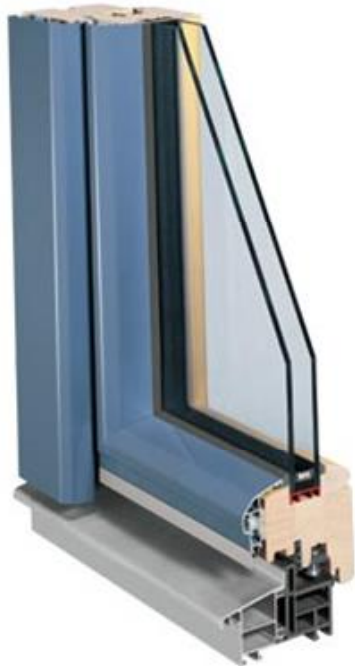
Cross section of an aluminum clad window.

Aluminum clad windows typically come with anodized or baked enamel finishes. The baked enamel finish allows for a wide variety of colors to match other colors of the building. Aluminum is used as the facing material over the wood frame for the trim, sash units and muntins. They are often manufactured with double glazing for energy efficiency. Aluminum clad windows have been approved by the National Park Service for tax certification projects where the original windows are beyond repair. Aluminum clad windows are not considered to be particularly “green” because of the large amount of energy expended in the aluminum manufacturing process and the use of new-growth wood in the frame.