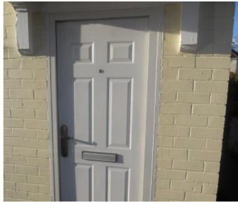
Examples of a composite door (left) and steel security door (right).