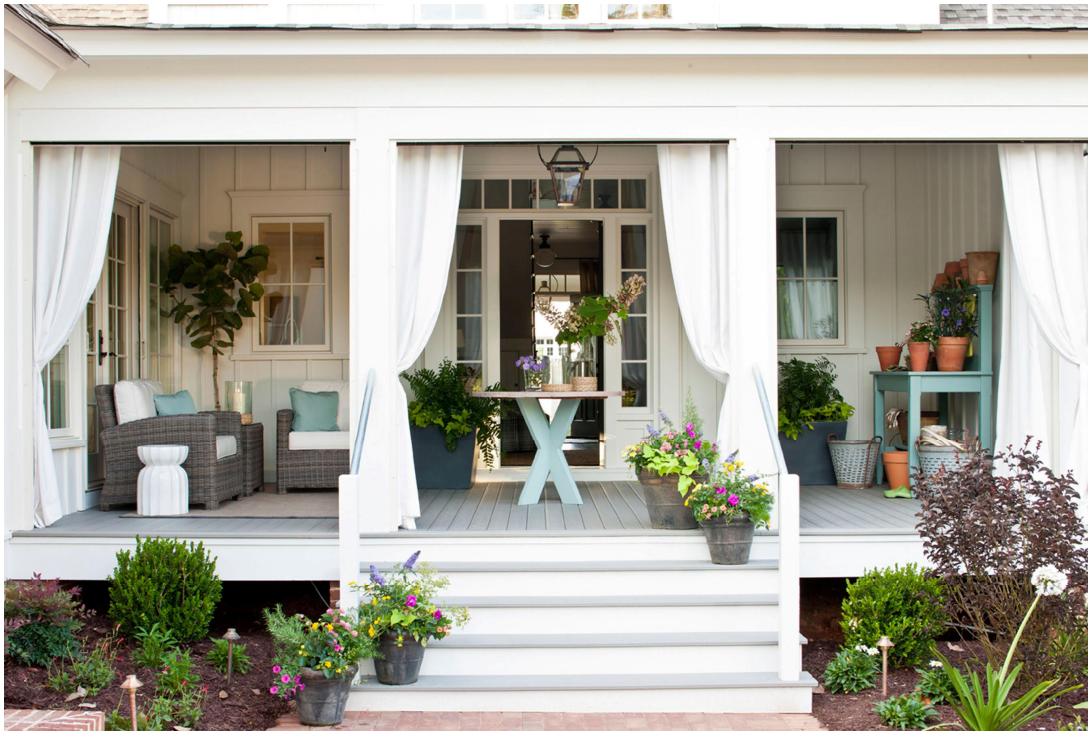
This example of a composite porch floor has a smooth finish in a light color.