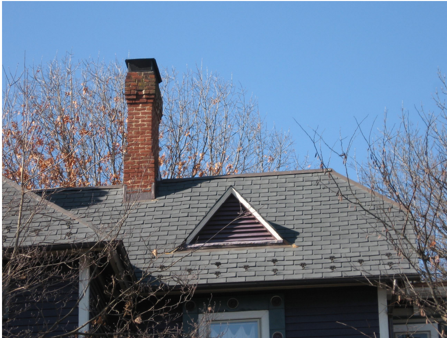
Example of a synthetic slate roof in a Roanoke, Virginia historic district.