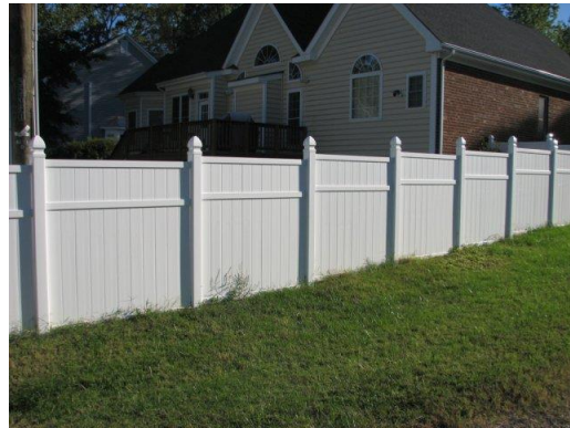
Vinyl fencing is available in imitation of a wood picket fence for front yards (left) and as a solid privacy fence for side and rear yards (right).