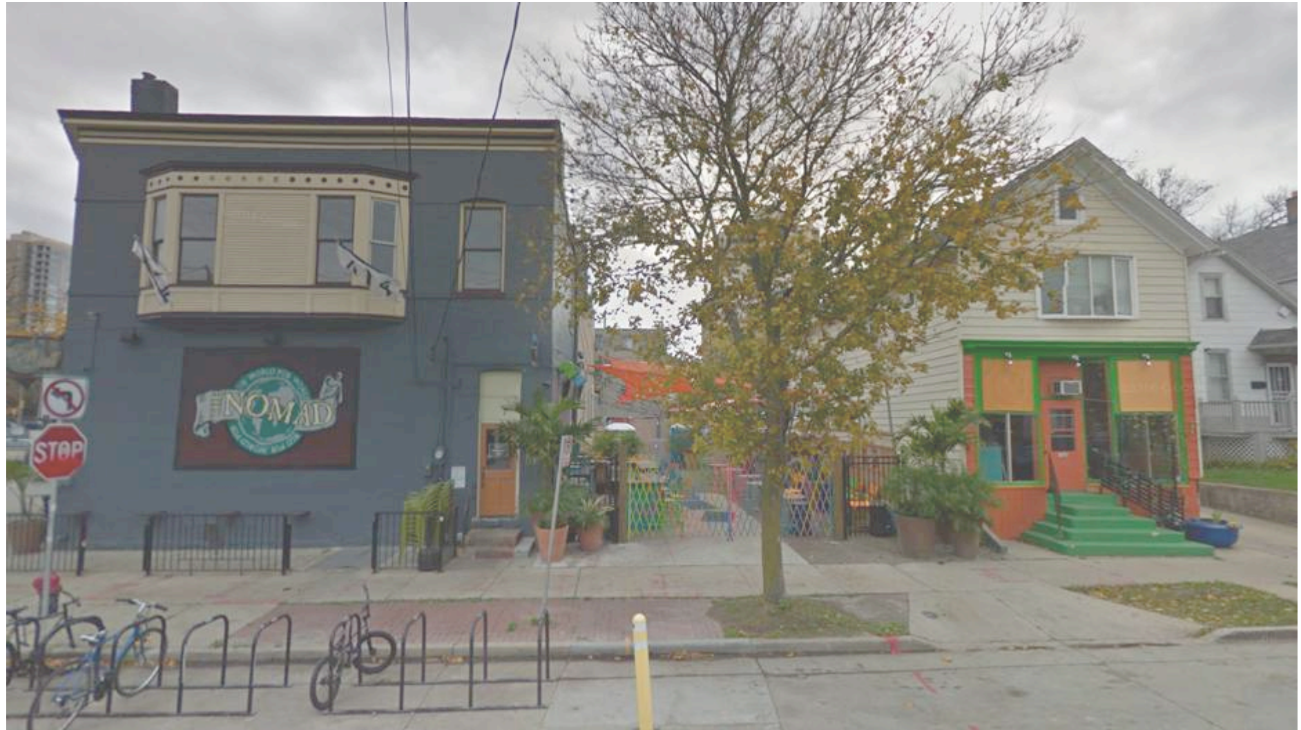
From E. Warren Ave, Looking East