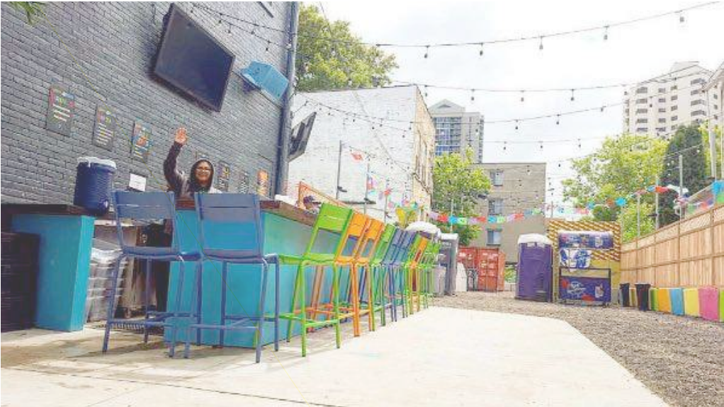
From E. Warren Ave, Looking East