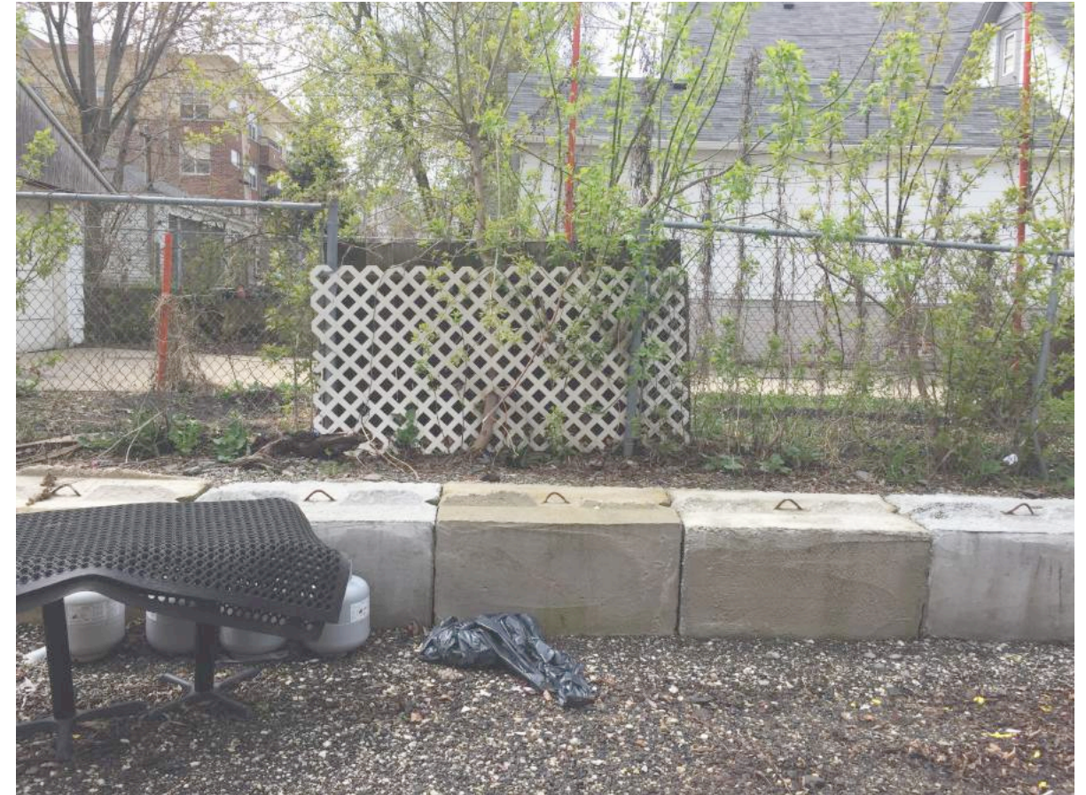
From Back of Seasonal Beergarden, Looking South