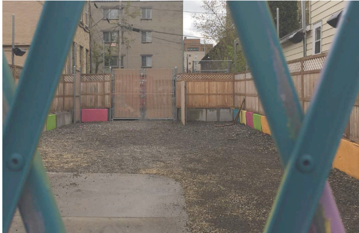
From E. Warren Ave, Looking East