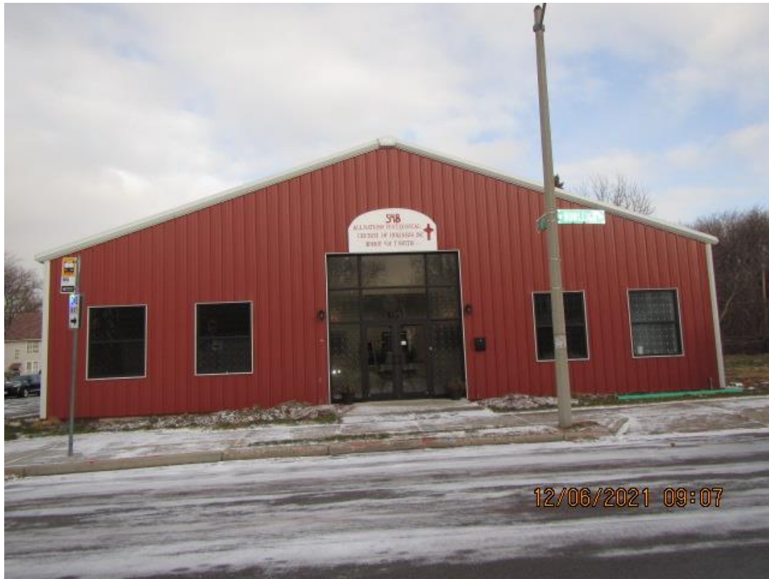
548 W Burleigh