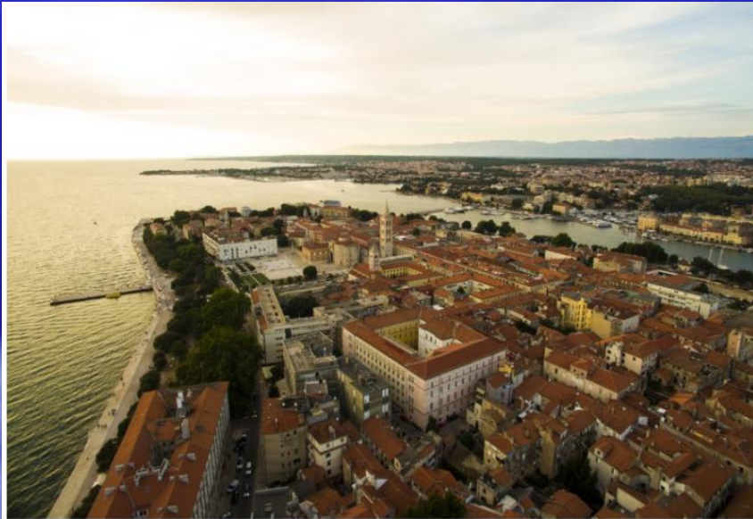
The Zadar Peninsula, Zadar, Croatia.

*Social *Economic *Recreational Importance