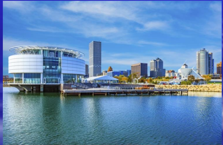
The city of Milwaukee, Wisconsin.