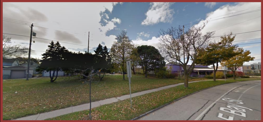
View from Bay Street, looking west