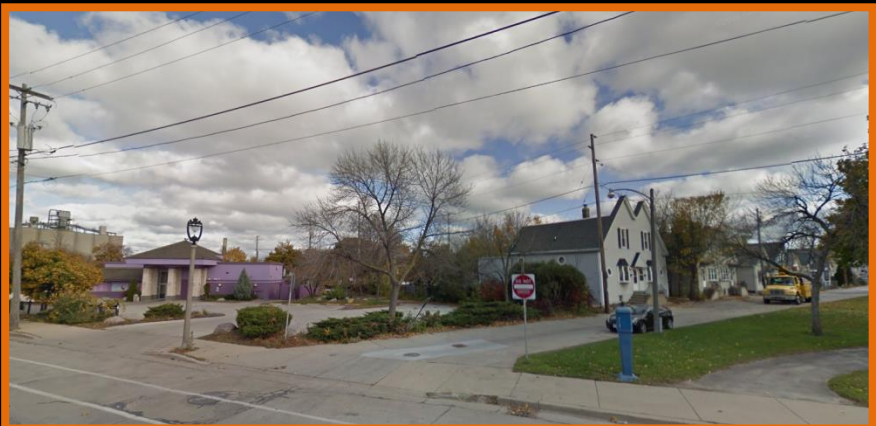
View from KK and Archer