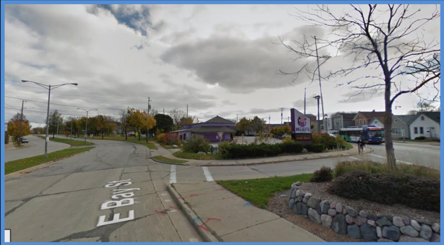
View from KK and Bay