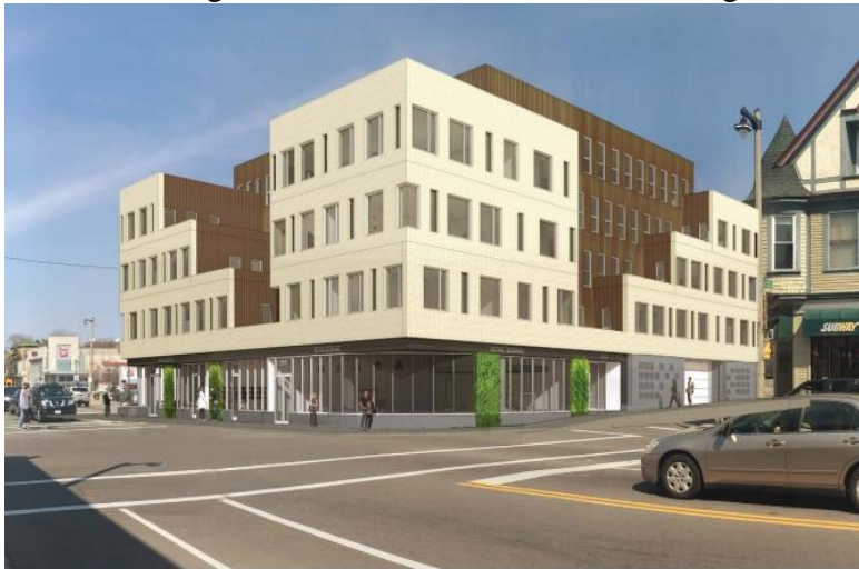
- LOCUST INTERSECTION LOOKING NORTHEAST

Pictures are powerful tools, and perspective a powerful device. For example, in the developer's picture (below), the 5-story proposed development appears shorter than the 3-story building on the opposite corner. Standing on the corner even now, it is clear this perspective is artistic license, not reality. The sky would be occluded from the corner, and from up Locust, towering over the trees, which other buildings on the street do not.