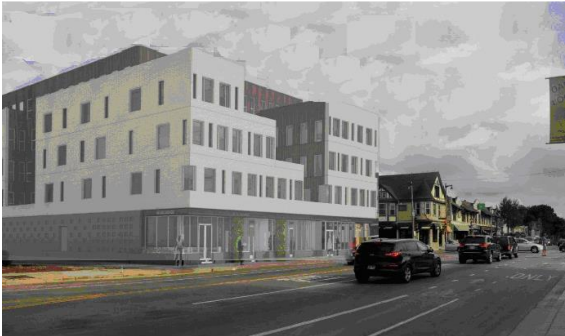
ND LOOKING SOUTHEAST

At other times, traffic even on Oakland is already heavy and dangerous. In the developer's own photo, a car is too-far forward waiting to turn left, presenting additional risk to any oncoming traffic. There is no left turn arrow for that white car, it just has to wait for the yellow. 60 to 90 more cars accessing the 2-lane street around the corner will not improve this situation.