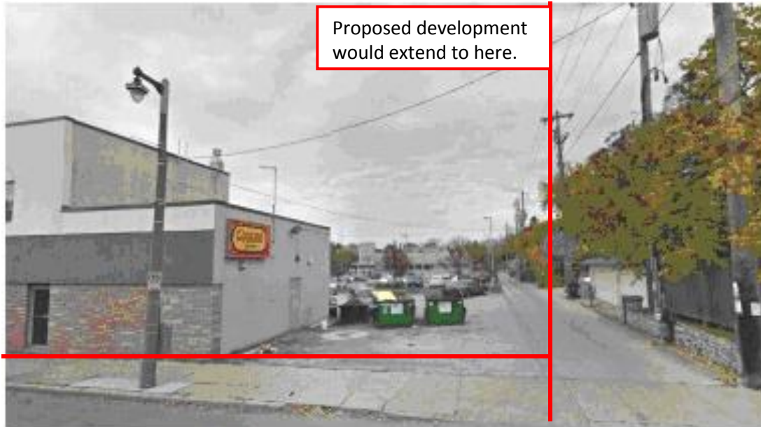
VIEW DOWN ALLEY LOOKING NORTH

The proposed building cuts off life-saving traffic preview dictated by ergonomics best practices. Emergency vehicles coming down the street will be invisible until cars are crossing the intersection. The design and materials of the proposed building would create an echo effect as well, obscuring the source and direction of the emergency vehicles. As this area is heavily populated and used by university students, i.e. less experienced drivers, the need for such preview is especially critical in this location.