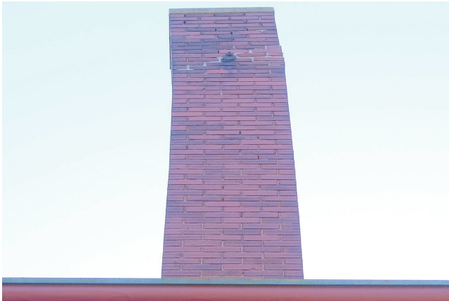
IMAGE 10: The south chimney has a noticeable northward tilt. Deterioration of the brick and mortar joints is visible from the ground.