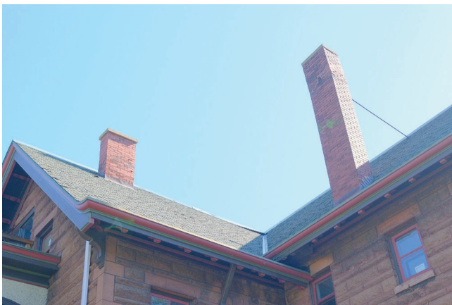
IMAGE 9: North and south chimneys with tie rod anchoring the south chimney.