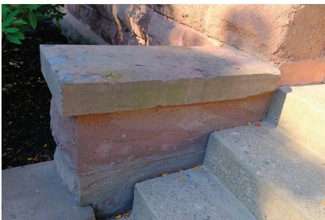
IMAGE 12: Previous repair and replacement attempts are visible on cheek walls. Spalling, cracking, and algae growth is also apparent.