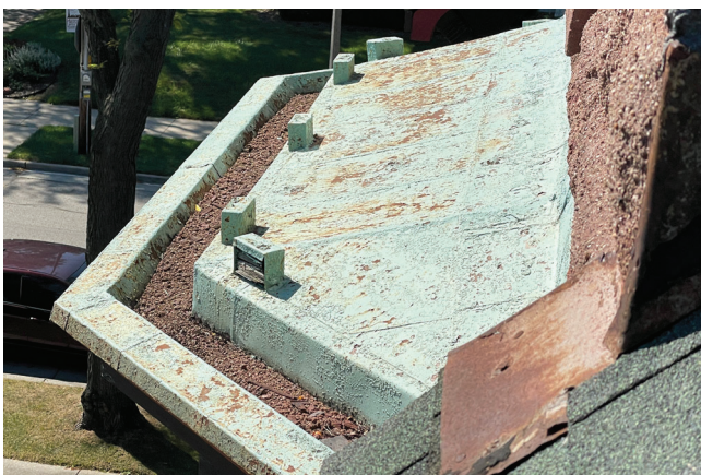
IMAGE 3: Surface corrosion on east bay roof, along with debris build up in the gutters. Note the box forms that once supported a decorative railing.