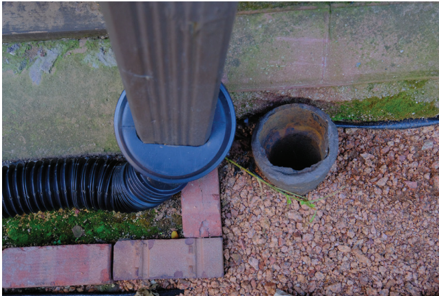
IMAGE 7: Algae growth at the base of the north elevation near downspout.