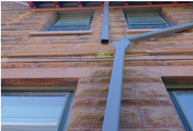
IMAGE 5: Second-floor V connection of the downspout on north elevation. Note the algae growth present where moisture has collected at the disconnected junction of the downspouts.