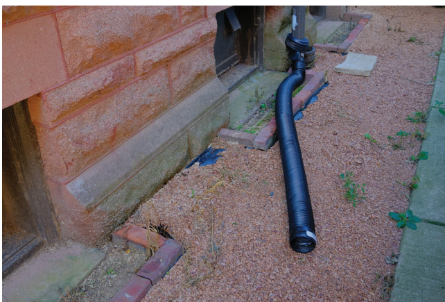
IMAGE 6: Recessed window wells on the north elevation. Downspout-extension outlets too close to the foundation, exacerbating moisture accumulation and algae growth.