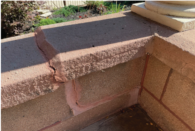
IMAGE 15: Cast-stone units have shifted significantly over time. Note the evidence of previous repairs.