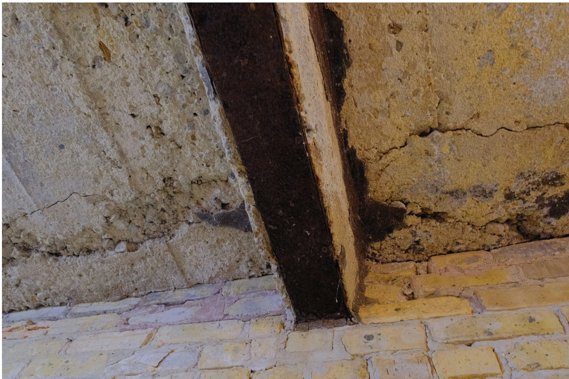
IMAGE 19: Close up image showing severe corrosion of an iron beam. Note the deterioration and cracking evident on the cast-in-place concrete ceiling.