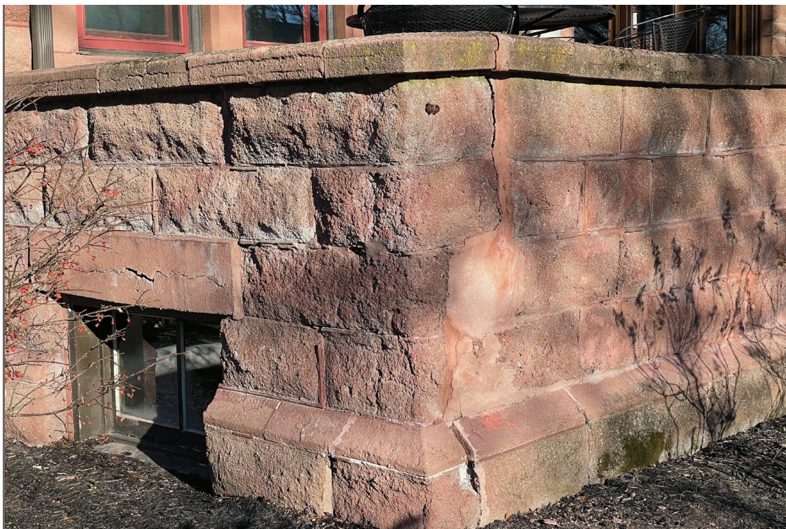
IMAGE 14: Some cast-stone units and open mortar joints have been replaced and attempts at repairs have been made. Shifting and algae growth are visible.