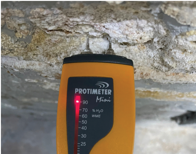
IMAGE 8: High moisture-meter readings along the perimeter walls in the basement.