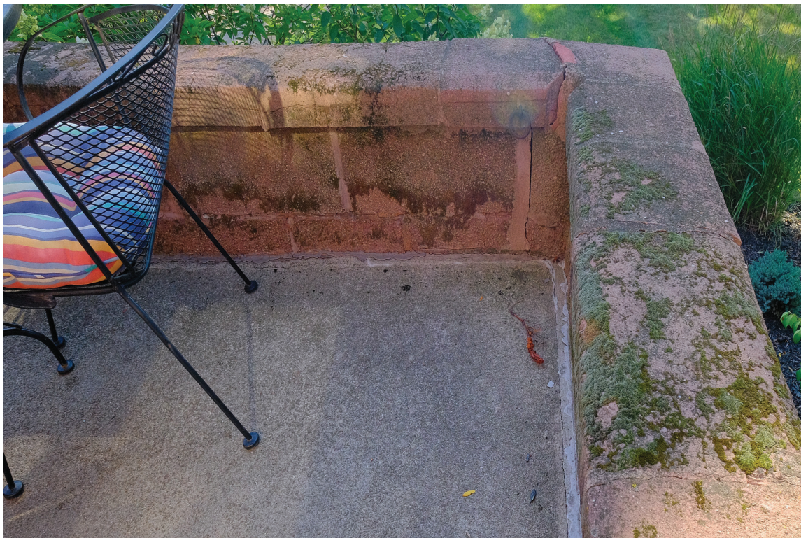
IMAGE 13: Algae has begun to grow on some porch surfaces. Note the evidence of shifting cast stone units and cracking in floor slab. Previous repairs are also evident.