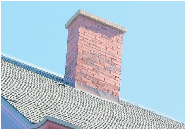
IMAGE 11: Deterioration of the brick and mortar joints on the north chimney is visible from the ground.